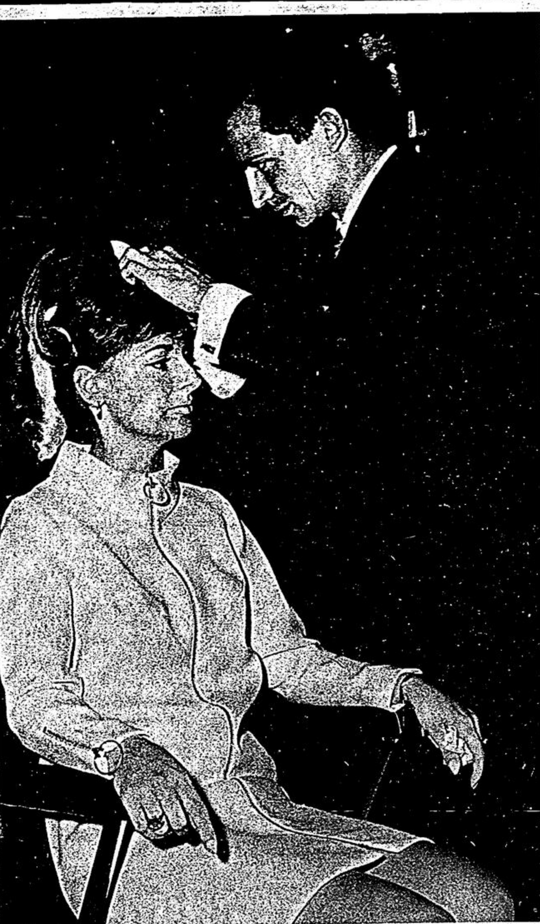
A creator at work