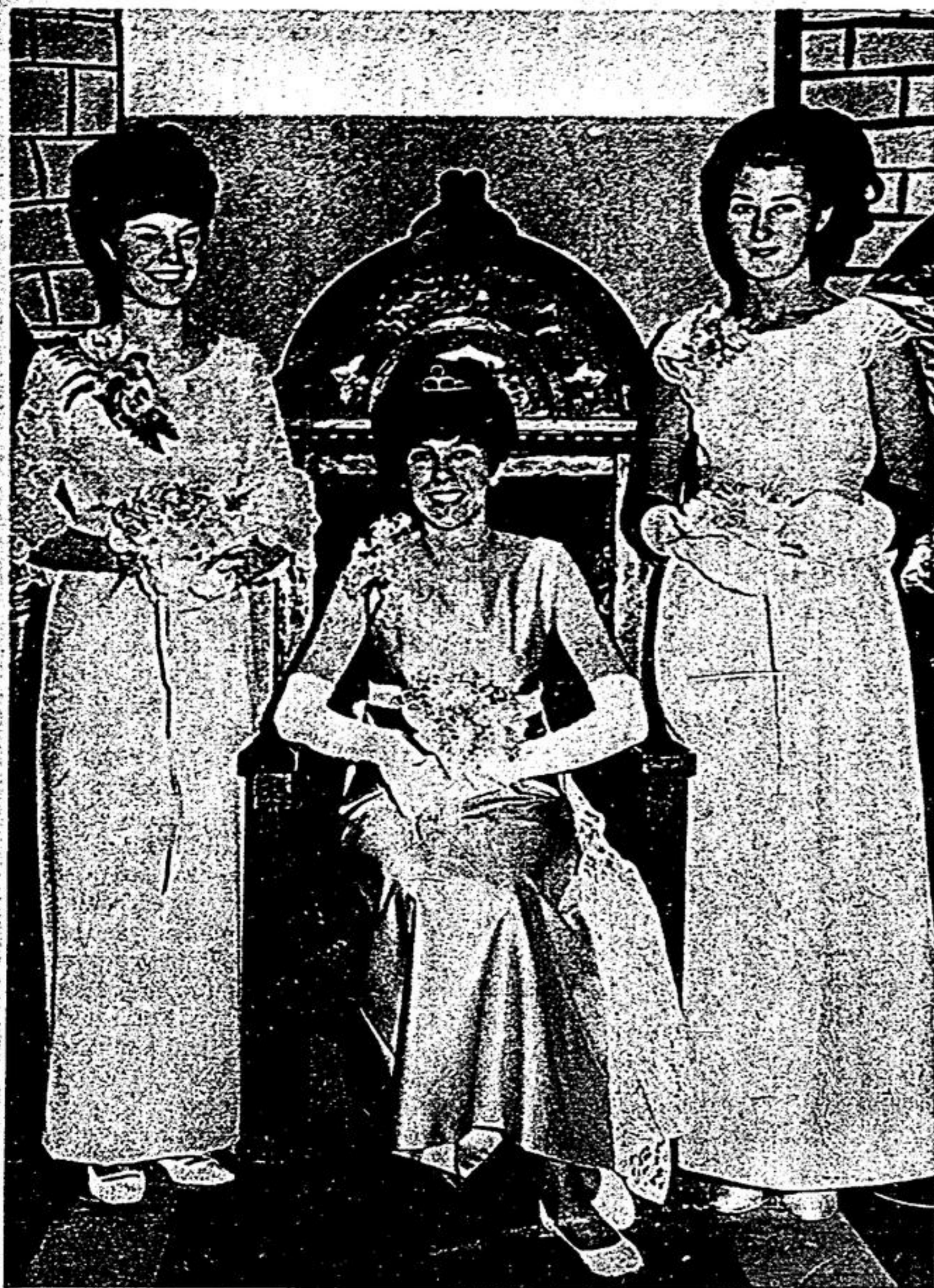
Markham queen and her court