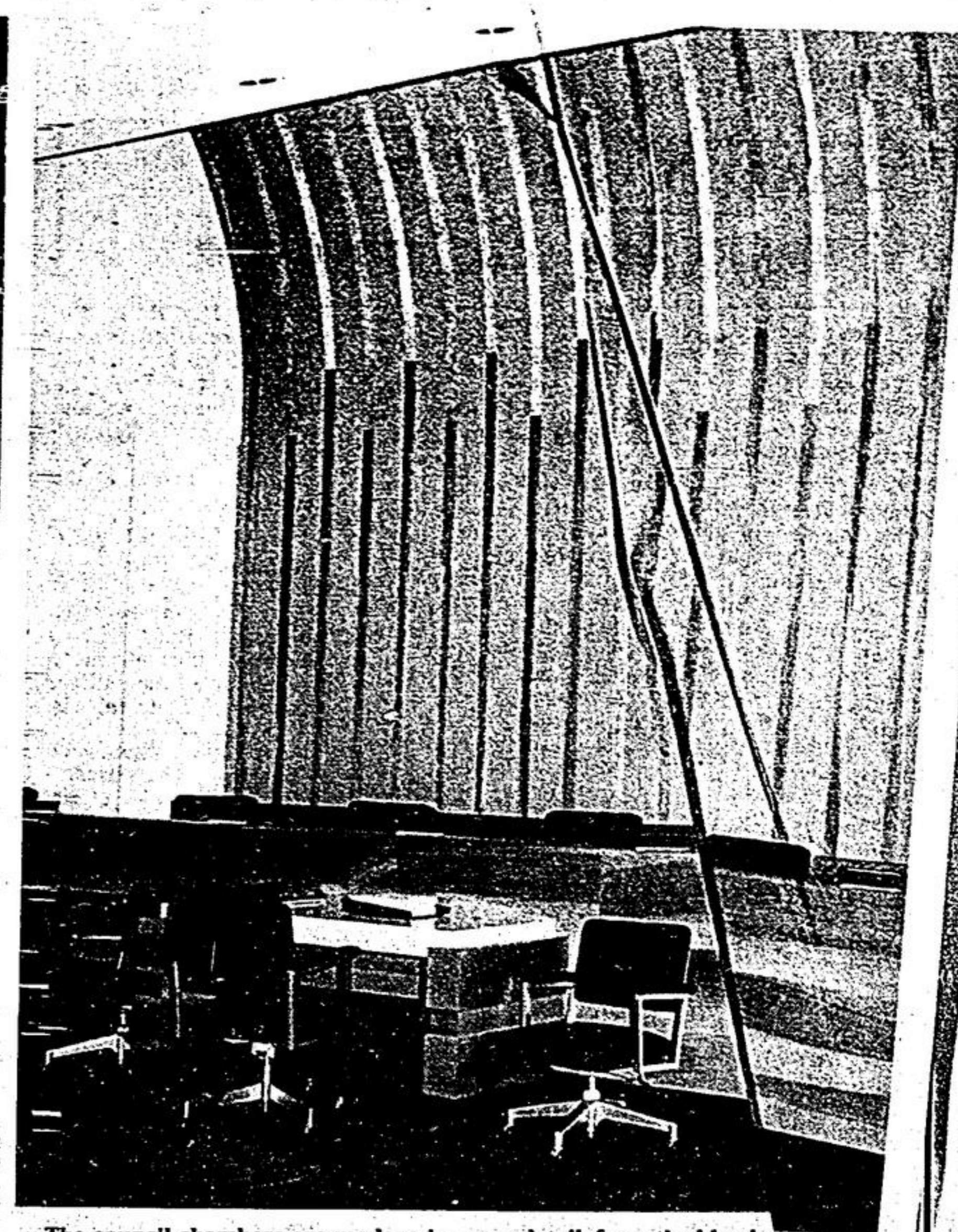
The council chambers are modern in every detail, from the blue brick floor to concealed fixtures in the ceiling. The cost of the entire project is estimated at $300,000. An official opening is planned for June.