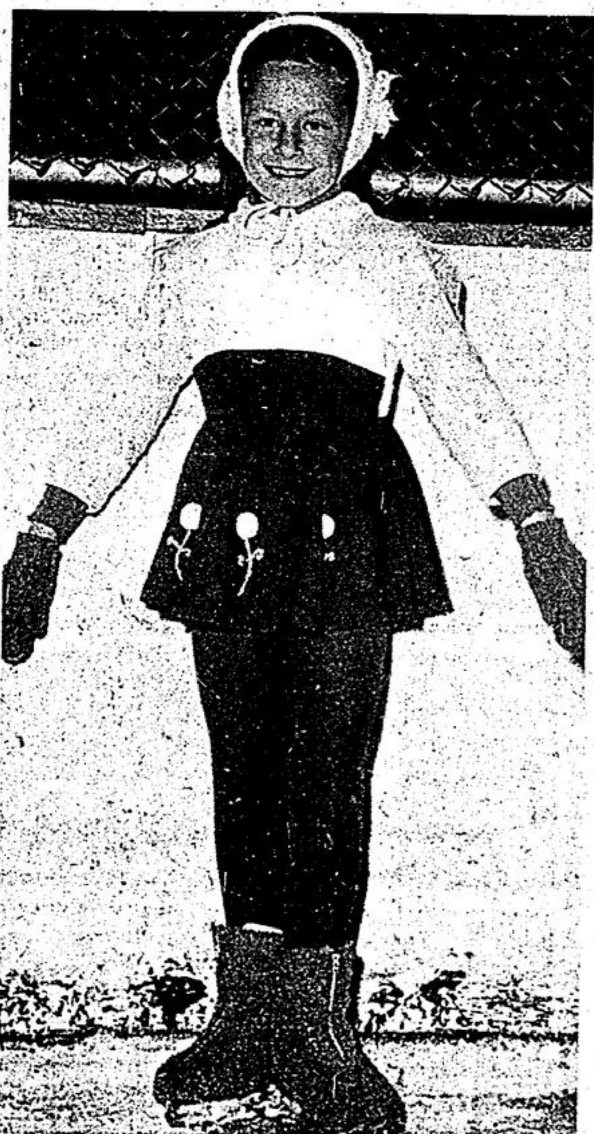
A skating doll