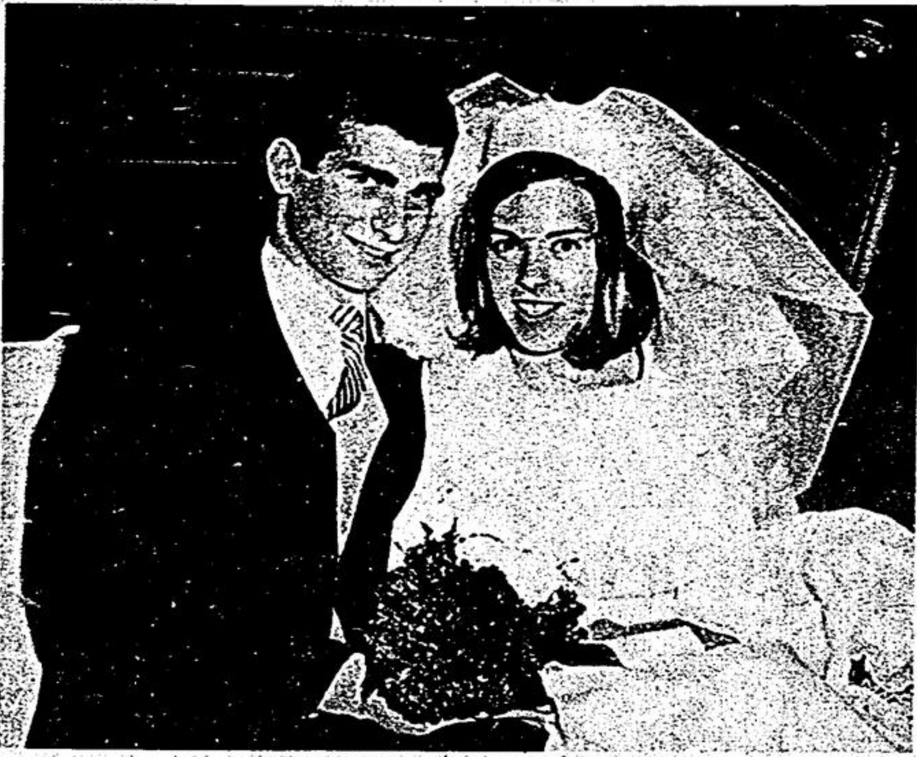
Lovely mid-winter wedding