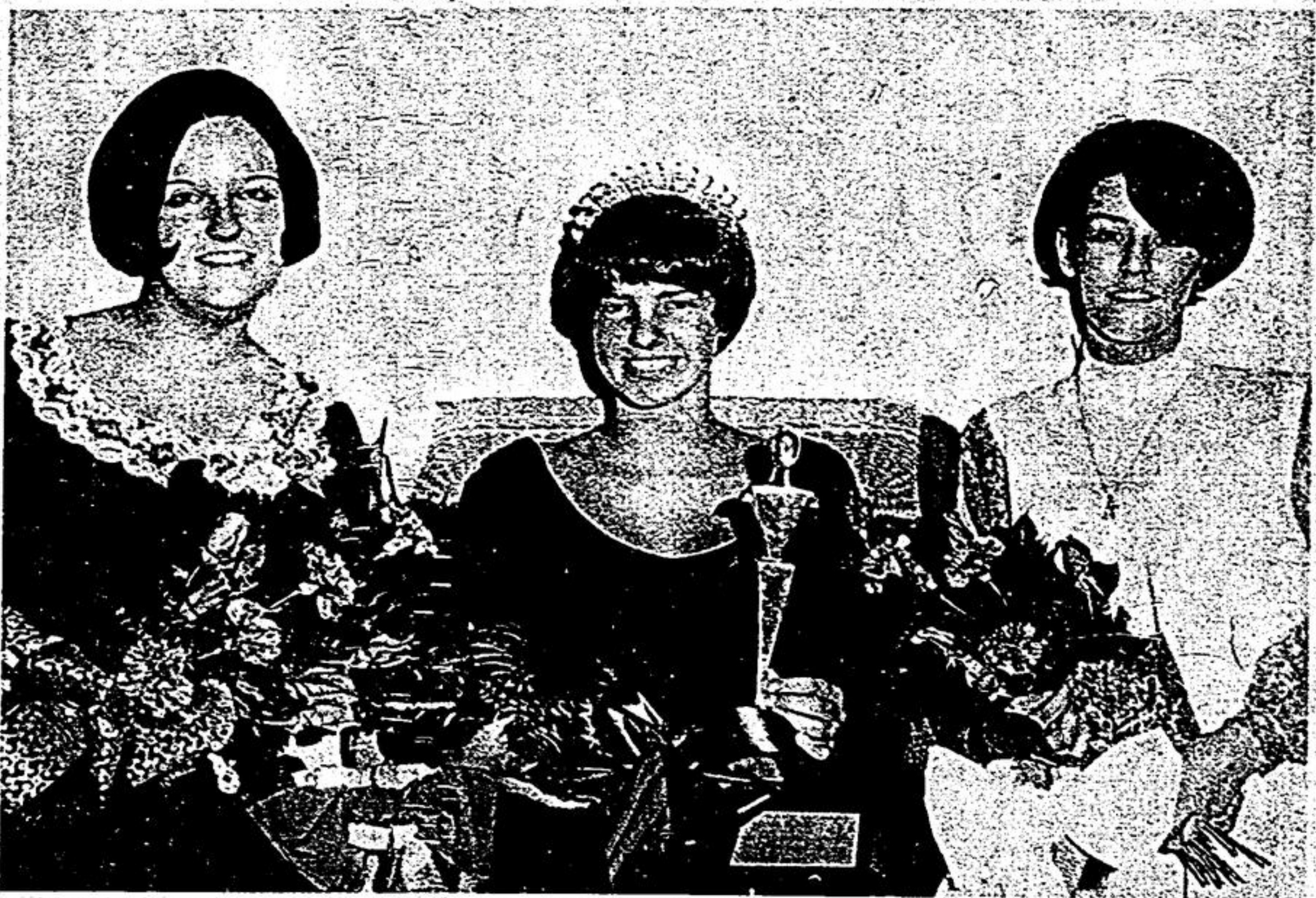
The "Straightest" girls at Stouffville High