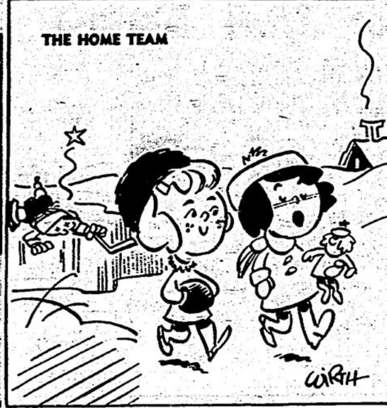
"A Davey Keon he's not!"