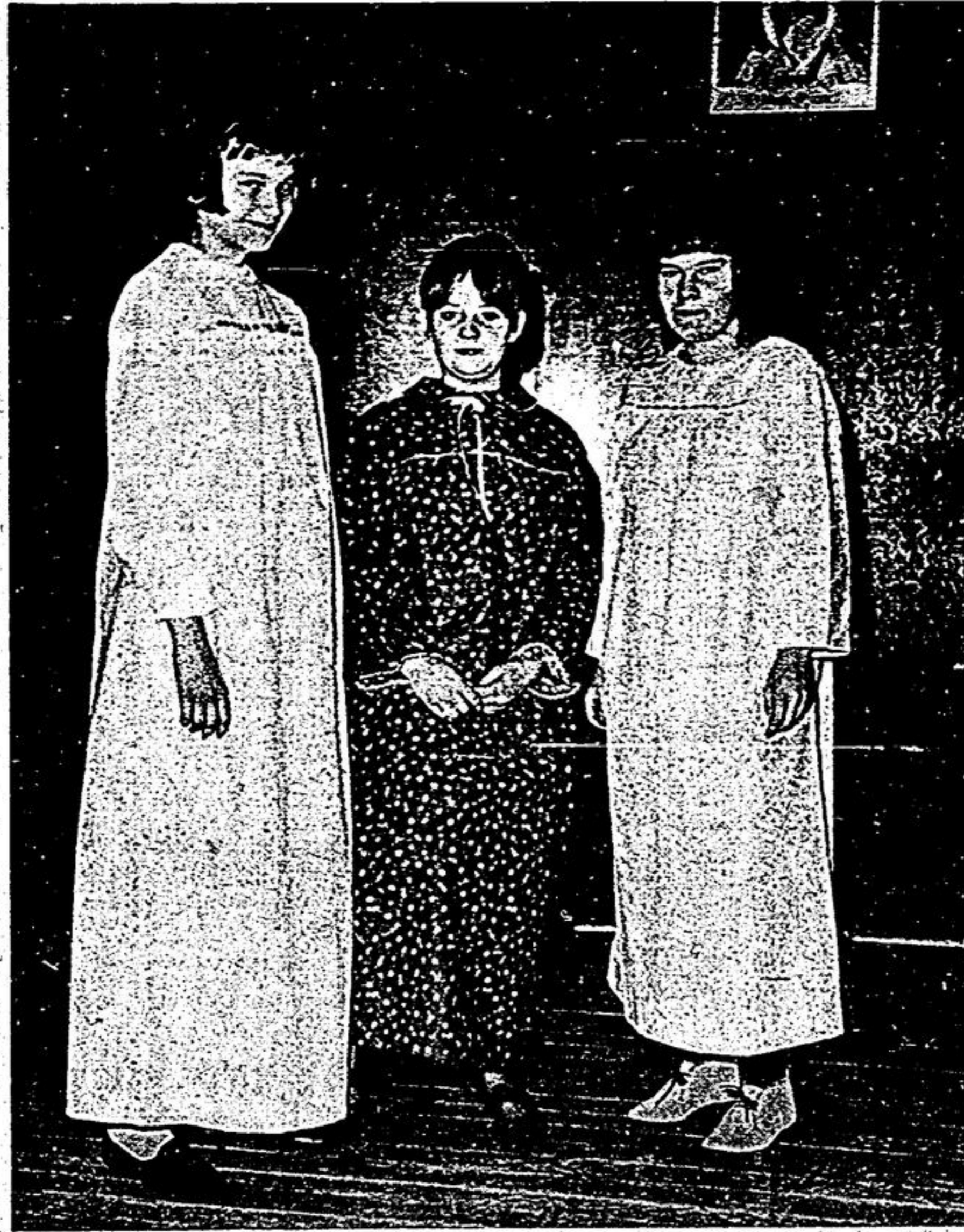
4-H Homemakers Display Handiwork

Your best market place is Tribune Classified ads.