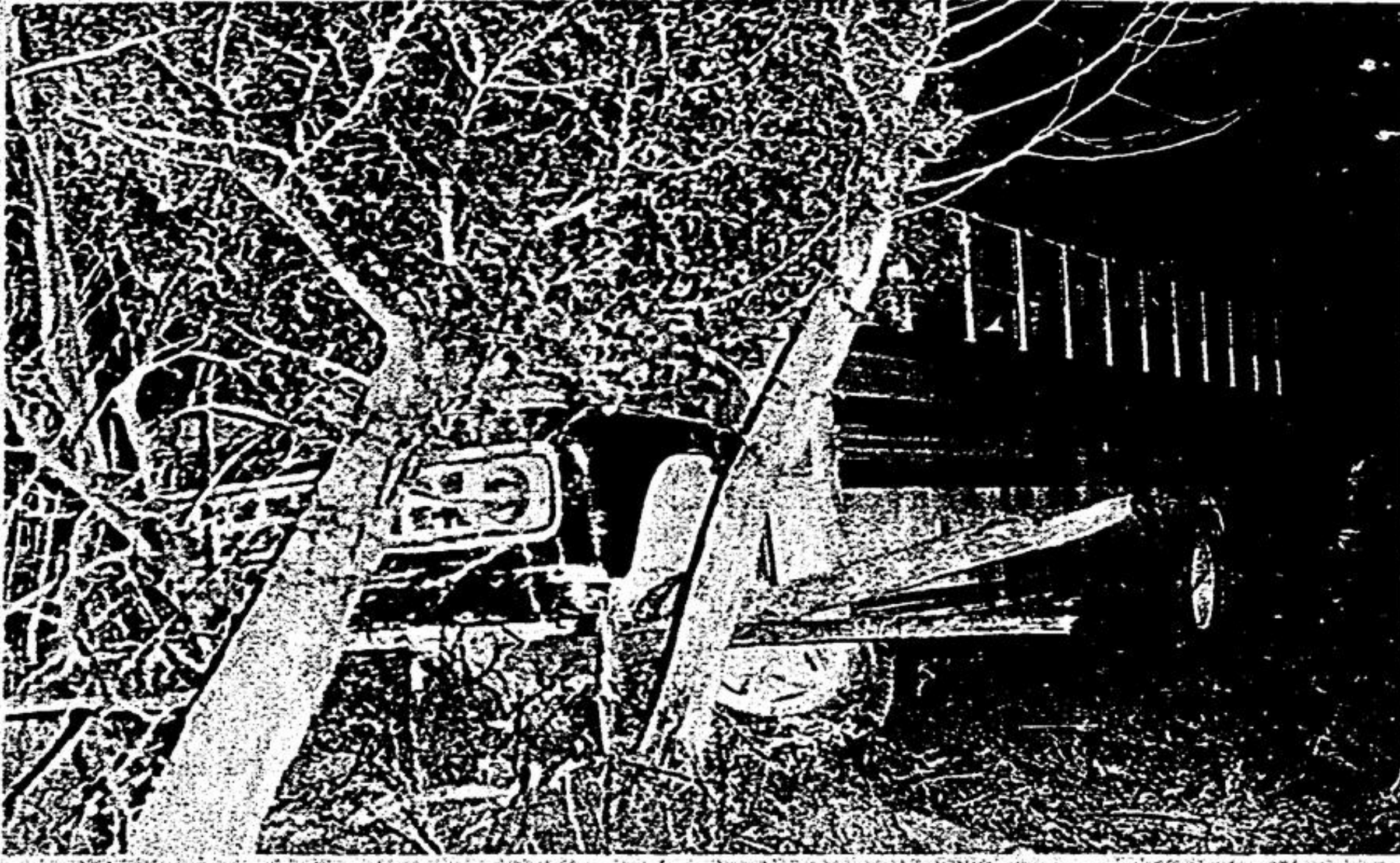
The driver of this school bus and thirteen students escaped injury, Friday afternoon, following an accident at the intersection of the Vandorf Road and conc. 6, Whitchurch. The front wheels of the bus were torn from the chassis after it plowed through the ditch and snapped off a large tree.