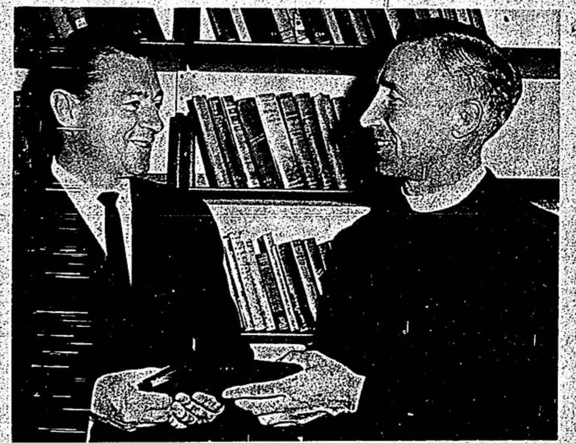
Centennial Project in Markham Village, A New Public Library.