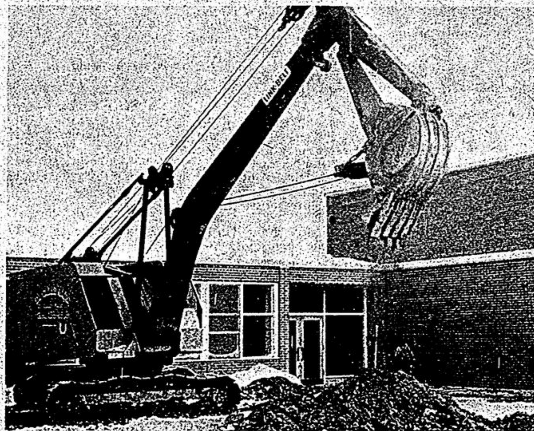
High School Addition, a 1 1/2 Million Dollar Project.