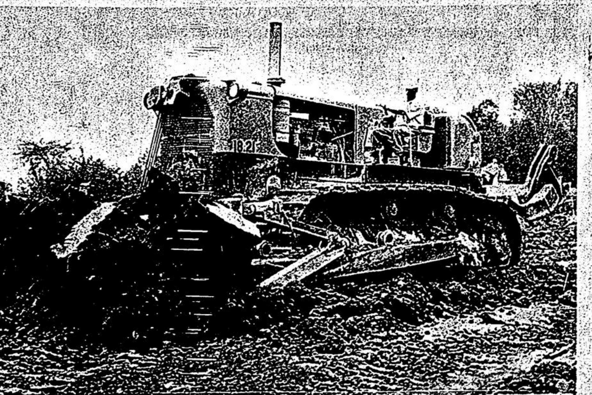
Begin Work on 140 Home Development in Stouffville's West End.