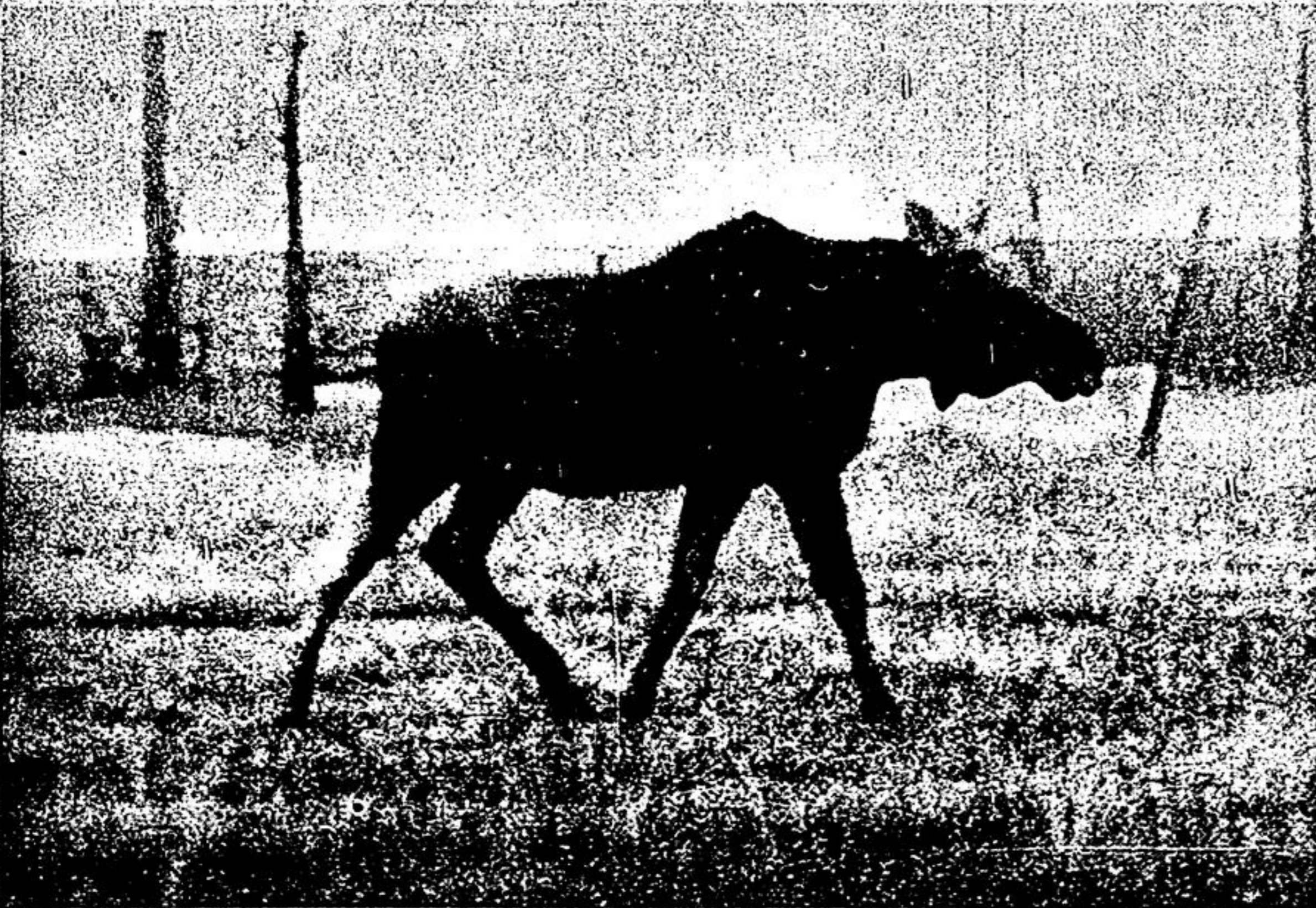
Moose on the Loose Created Stir in Stouffville-Markham Area.