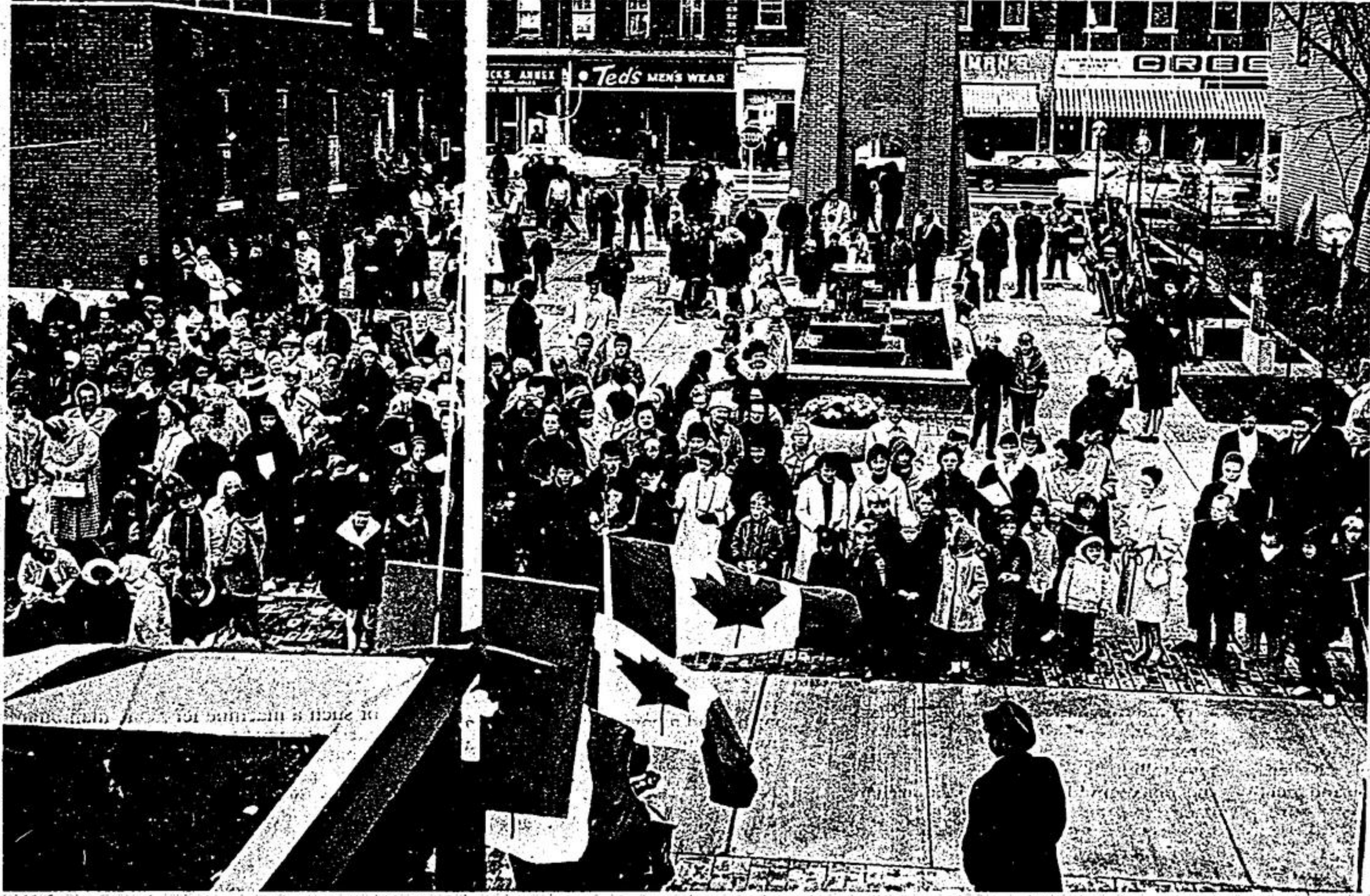
A portion of the crowd in the Civic Square is shown here during the opening ceremonies. A dinner in the United Church and a centennial dance at the high school concluded the day's activities.