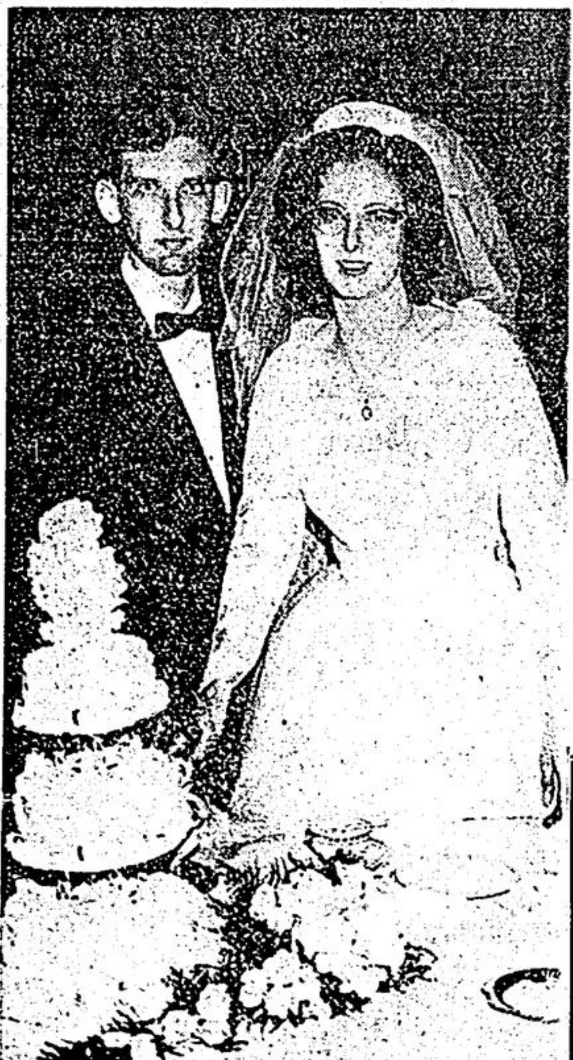
Married at Uxbridge