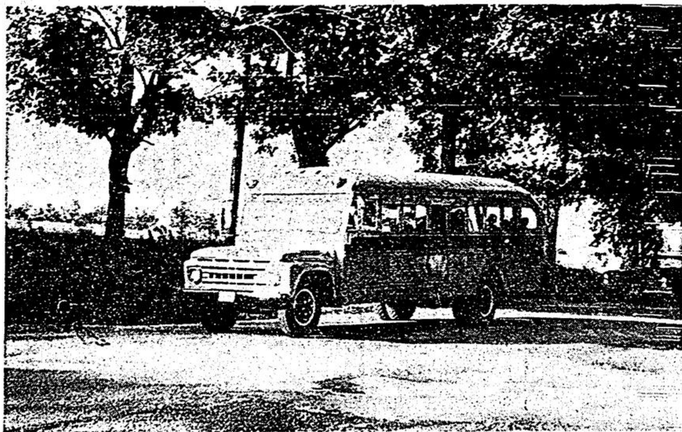
School Buses Criss-Cross at Altona Intersection

Every morning and afternoon, five days a week, the heaviest traffic at the four corners of Altona is made up of school buses, all going in different directions. No less than twelve, pass through the intersection daily, serving the Uxbridge and Pickering areas and St. Mark's in Stouffville. The drivers and students all seem to know where they're going but residents in the community are a little baffled by it all.