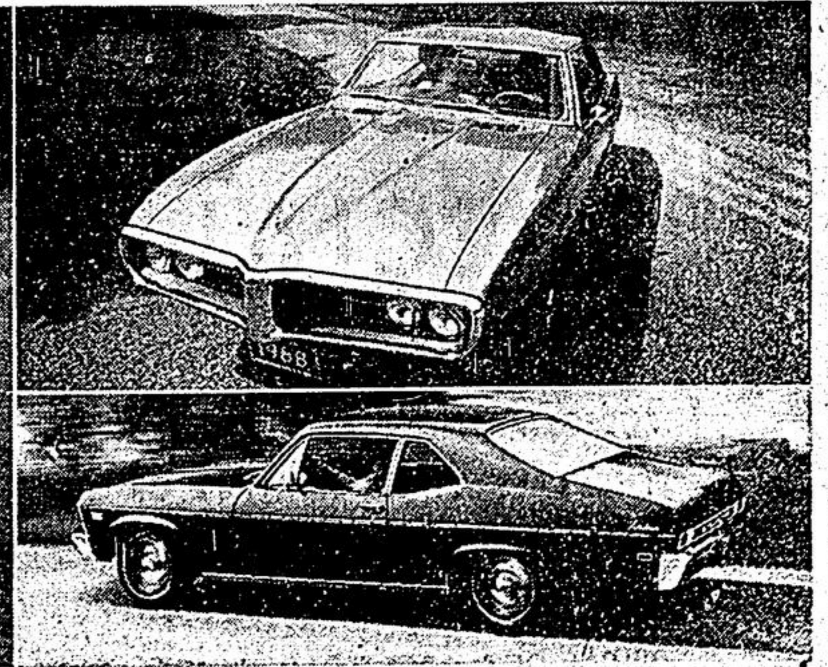
▲ '68 Acadian Two-Door Coupe.