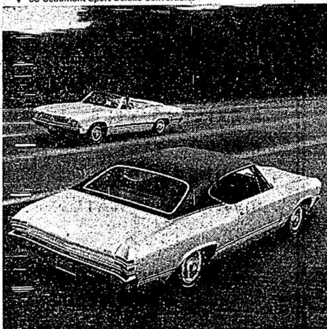
▲ '68 Beaumont Sport Deluxe Sport Coupe.