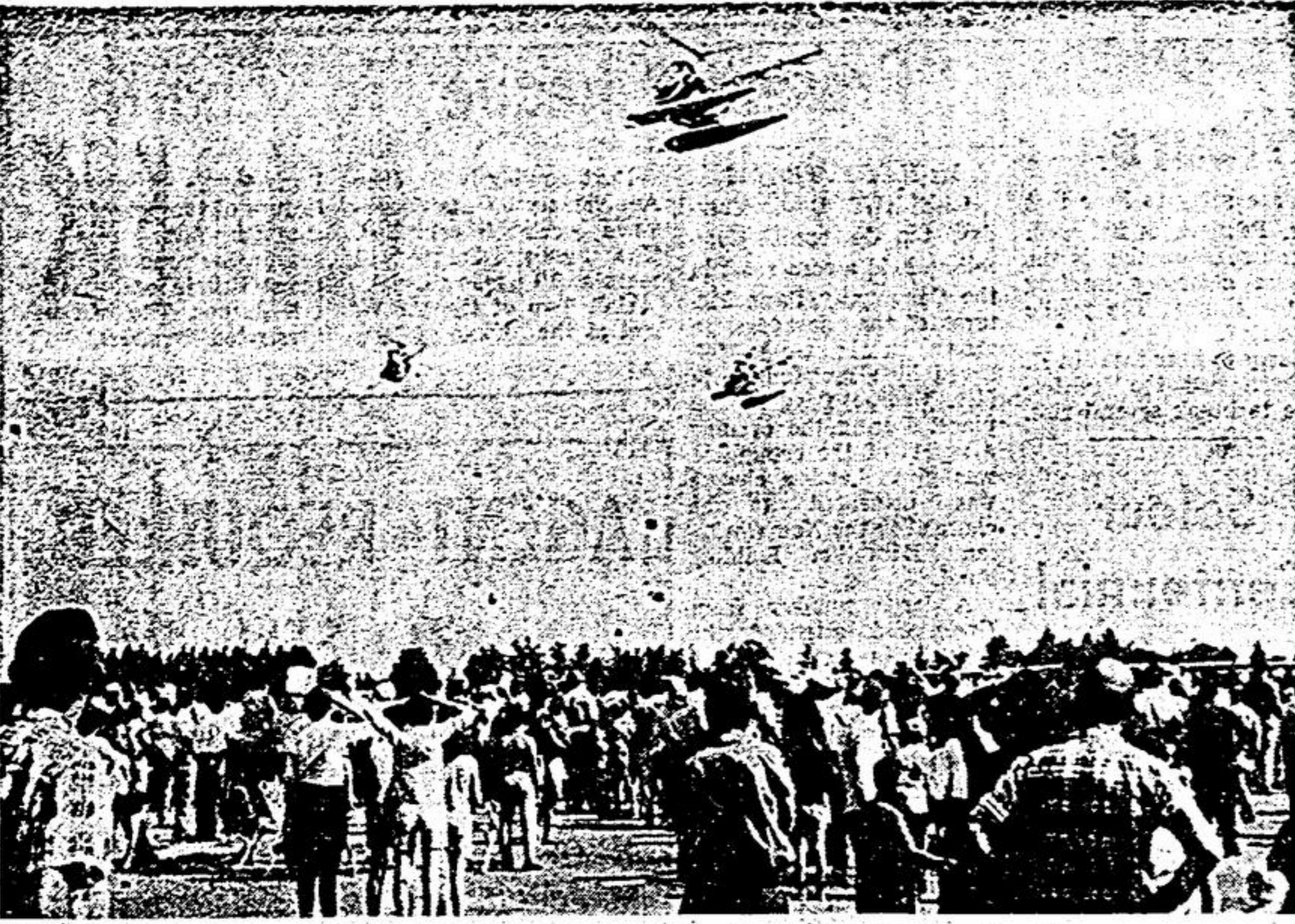
Over 50,000 See Air Show

TRIBUNE OFFICE SUPPLIES MAIN W. — STOUFFVILLE 640-2100