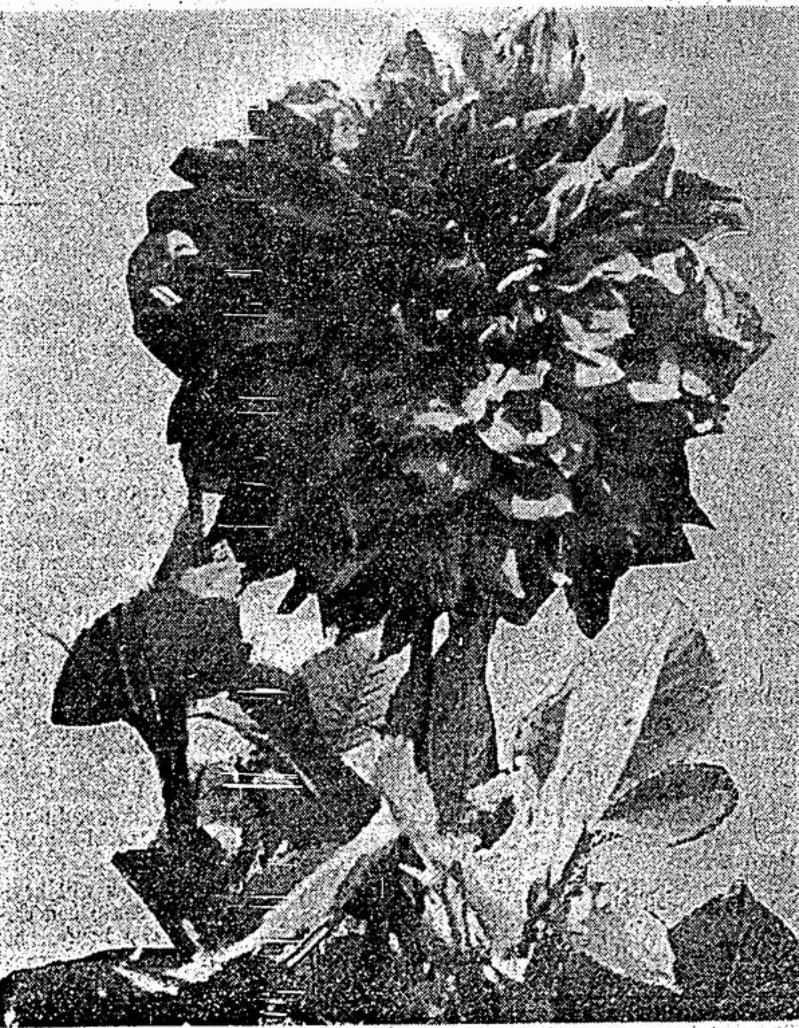
Giant Dahlia Grows In Stouffville