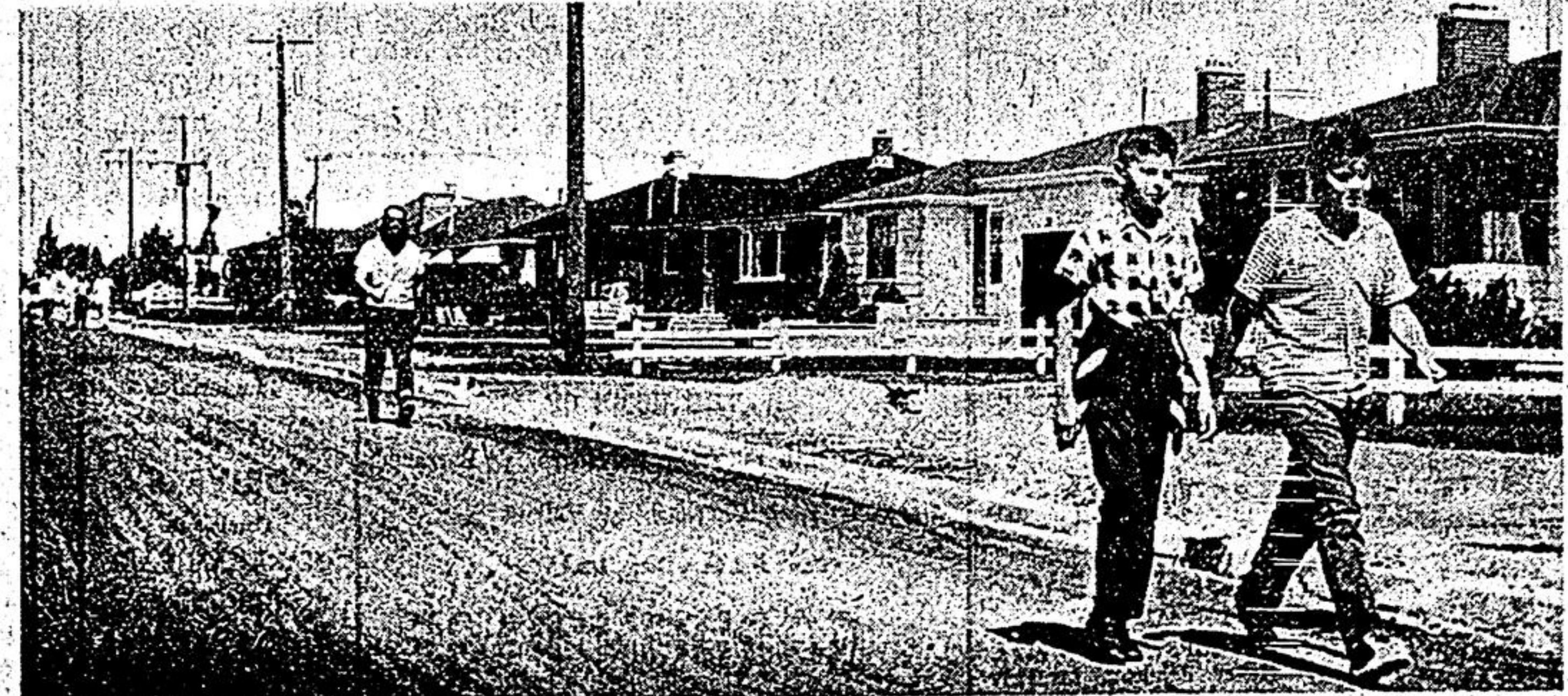
Marathon Walkers Begin Eight Mile Hike Down Ninth Line, Stouffville

Proceeds will be used for Stouffville's centennial projects.