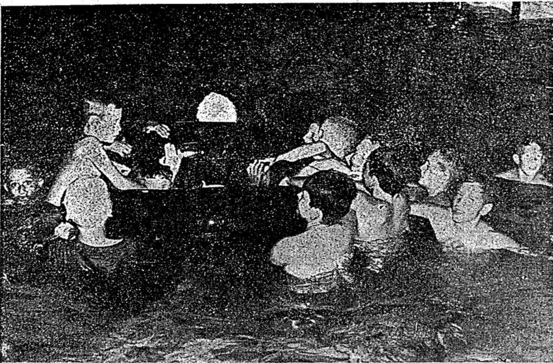
Many of these young swimmers took a ducking to the other, at the Annual Water Show, as they endeavoured to propel the raft from one end