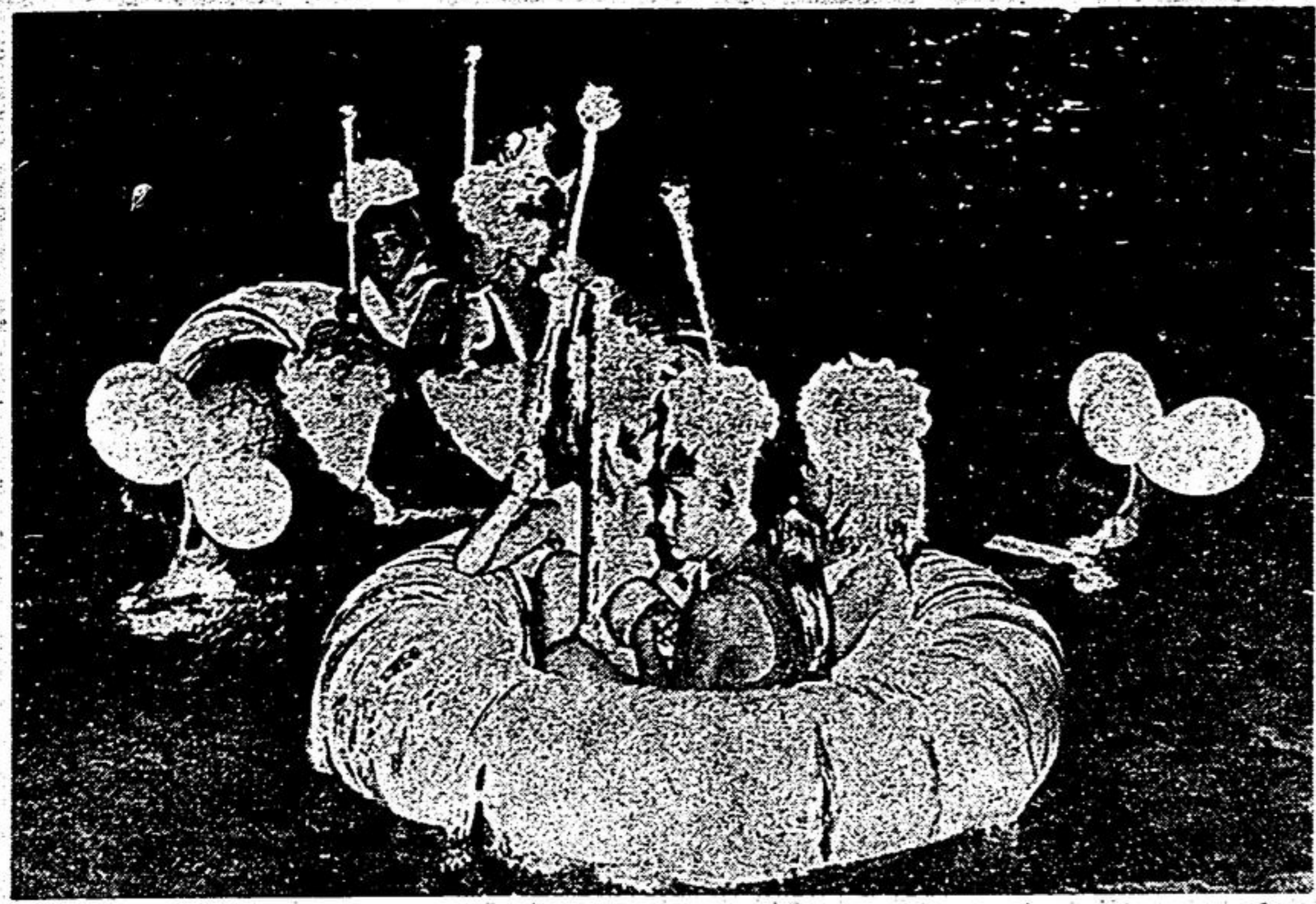
These charming young ladies braved the cool evening air, to delight the crowds with their Water Ballet at the Annual Water Show in the Stouffville Community Swimming Pool on Tuesday.