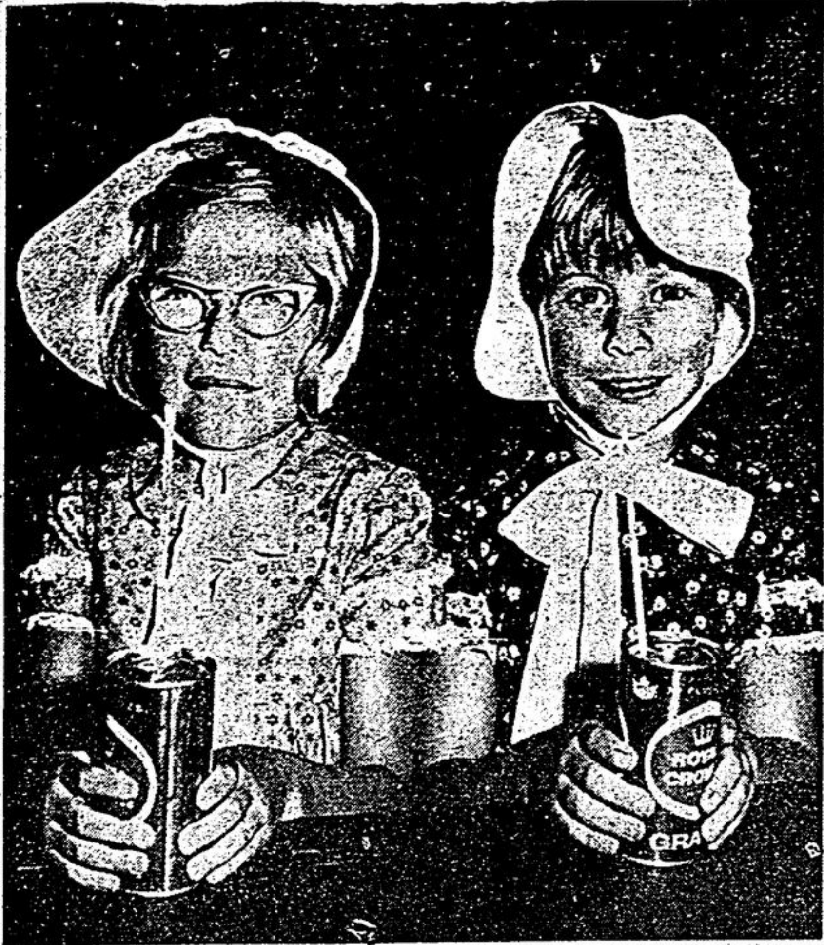
The Pause That Refreshes