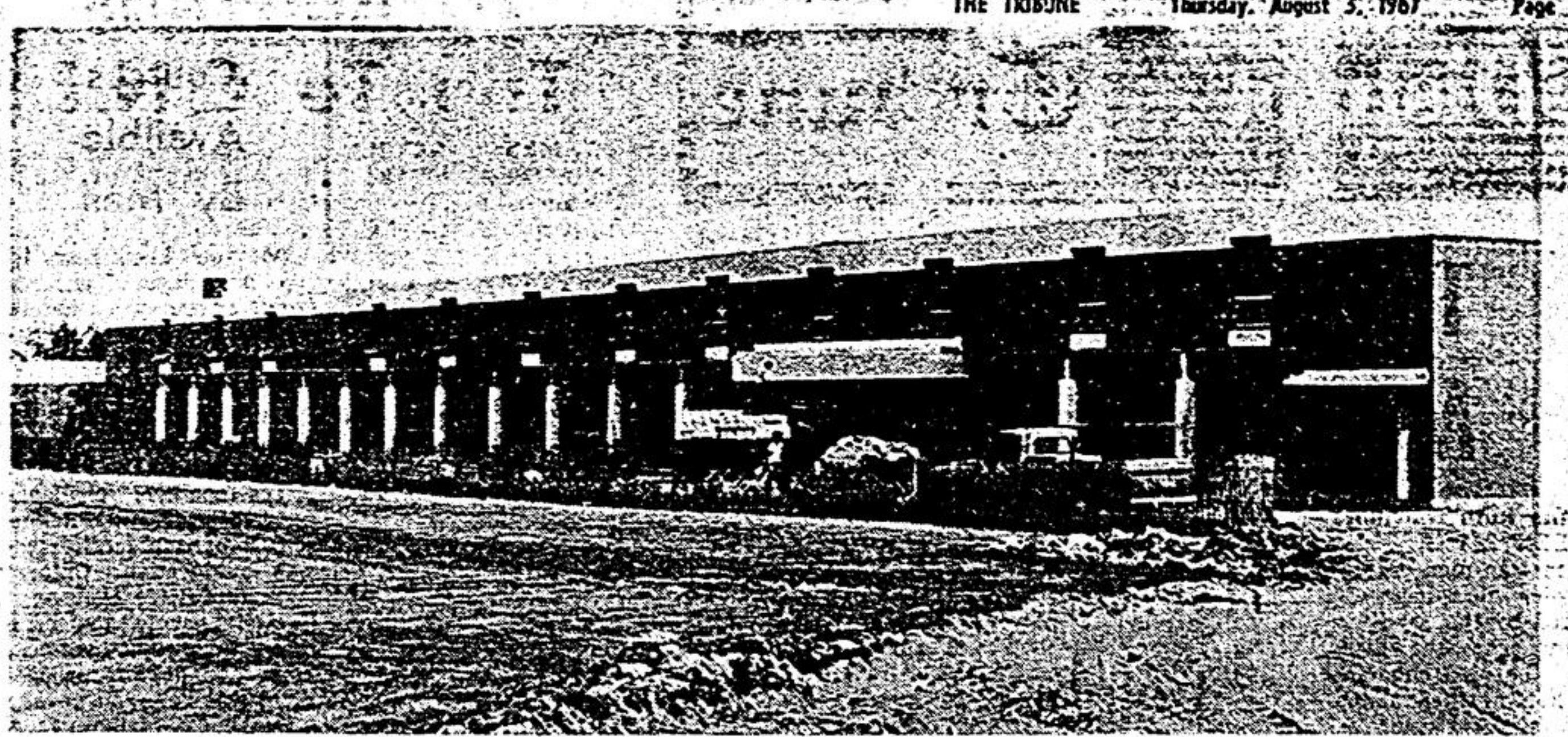
This is a view of the two-storey section of the new million dollar addition to the Stouffville District High School. It faces the north and the playing field. Work is progressing steadily on the vast new complex but total completion is not expected prior to the September opening.