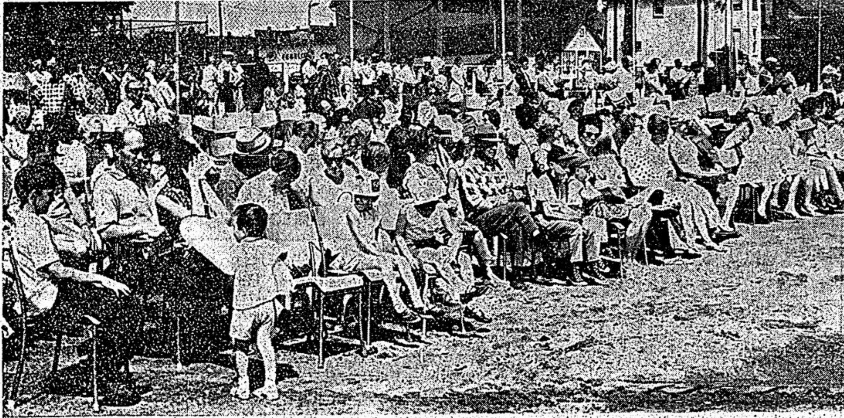
A portion of the huge crowd that attended the opening ceremonies in the park, is pictured here. In spite of inclement weather in the afternoon, they returned for the program at night.