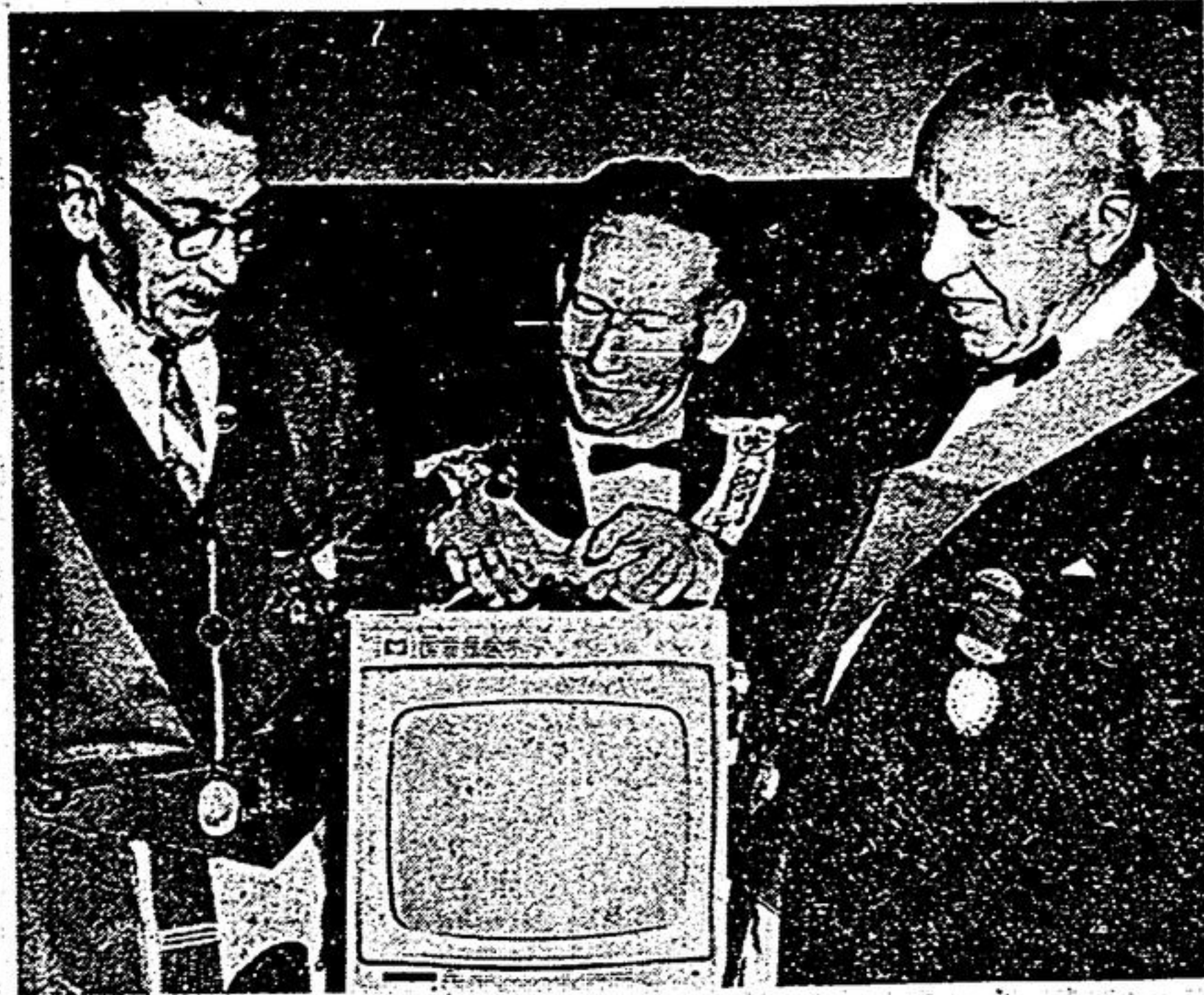
Richardson Lodge Member Honored