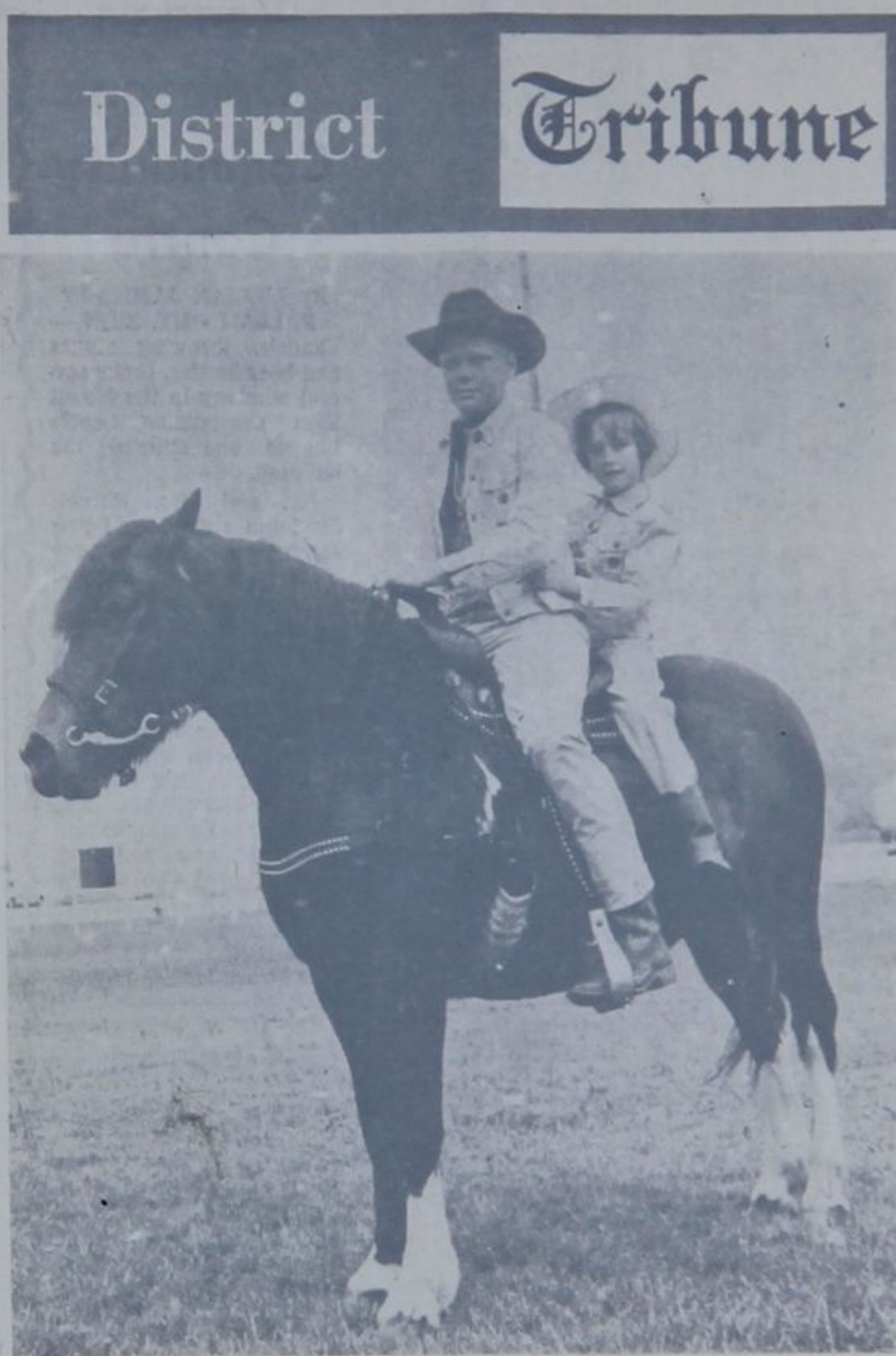
'Lady' Was Largest Entry In Pet Parade