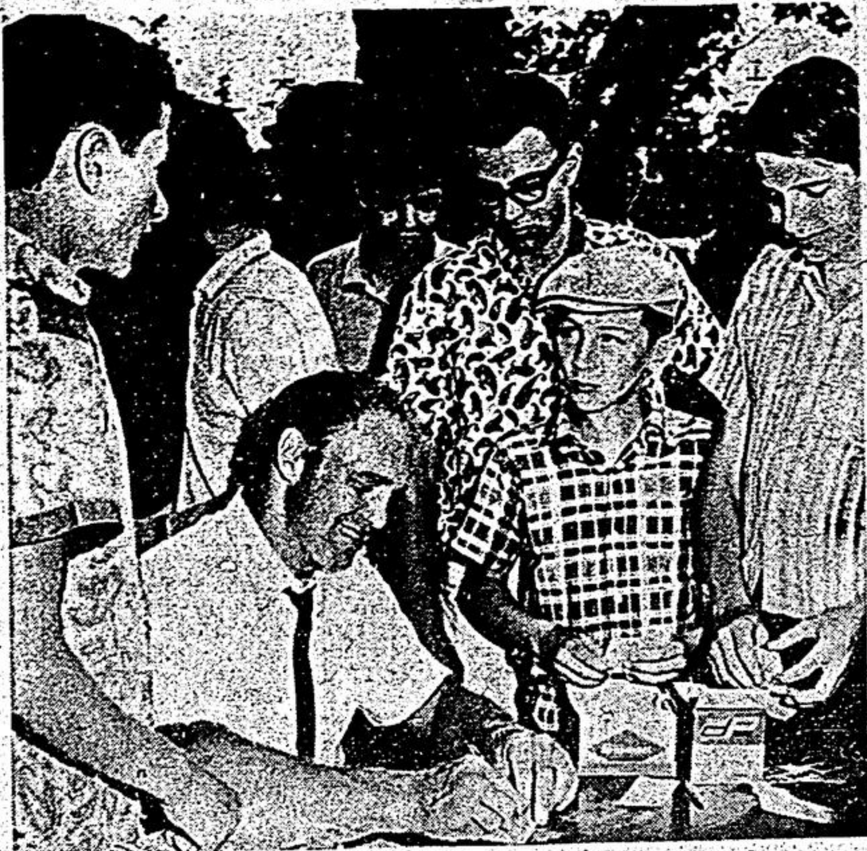
Chicago's Bobby Hull was the centre of attraction at Altona Friday afternoon. Boys of all ages and girls too, lined up for autographs.