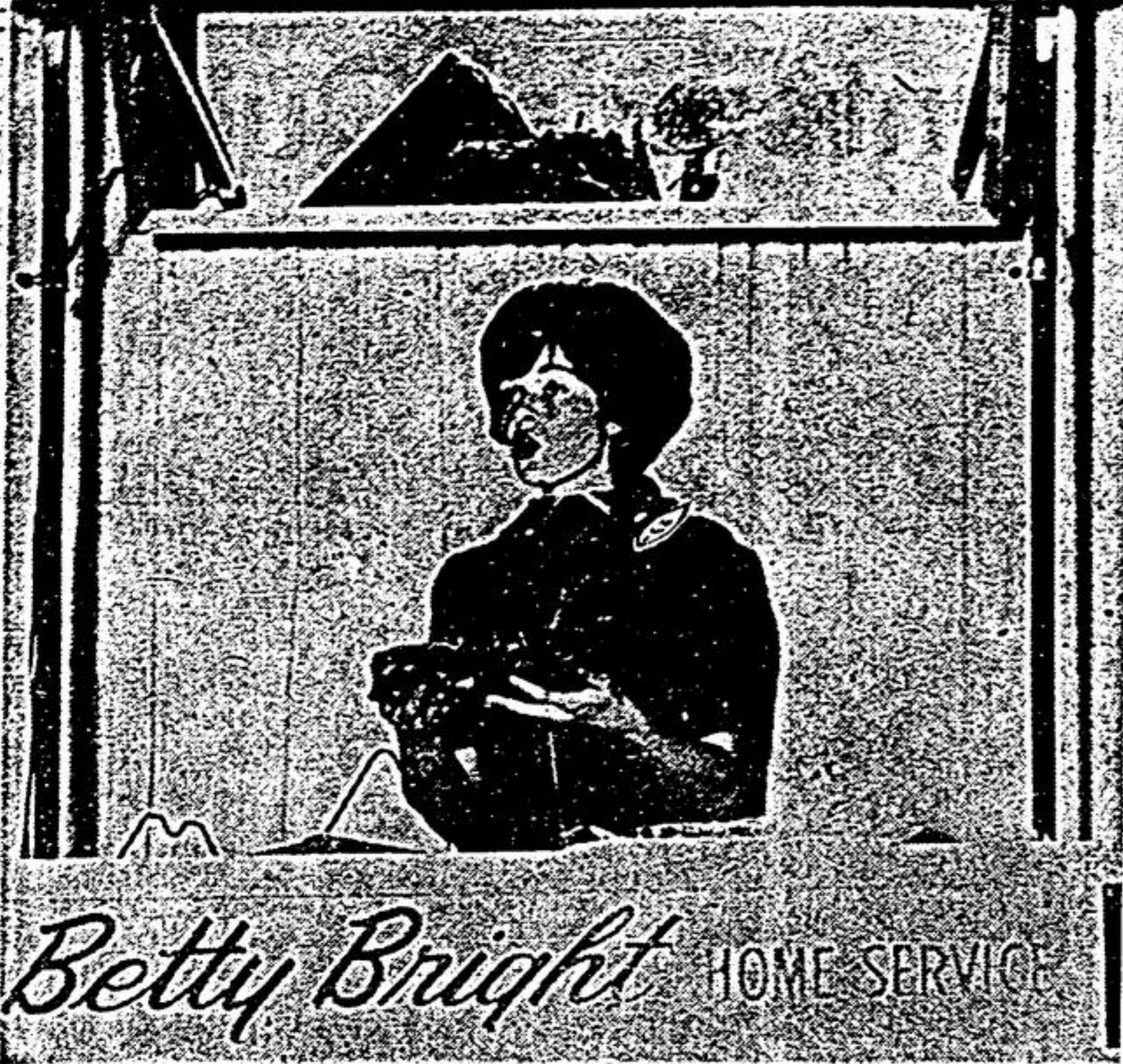
Betty Bright HOME SERVICE