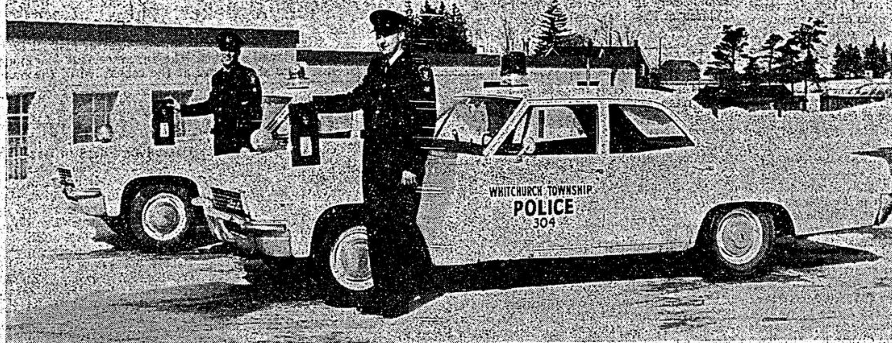
Each cruiser in the Whitchurch Township police department is now equipped with portable oxygen equipment, supplied by Erie Manufacturing Company of Ballantrae. In addition to many civilian uses, the units are also provided to the N.A.T.O. Air Command.