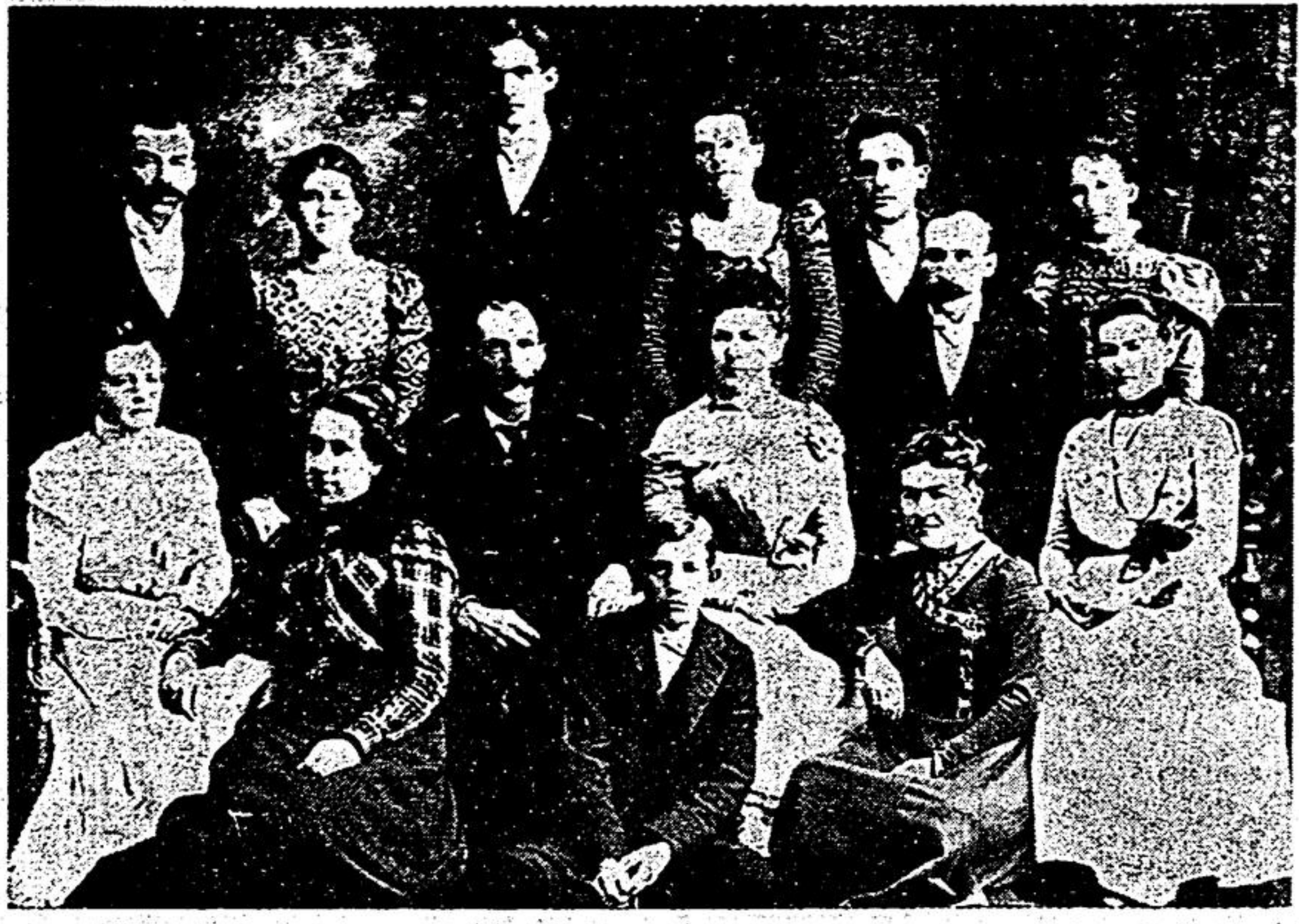
Melville Church Choir Of 70 Years Ago