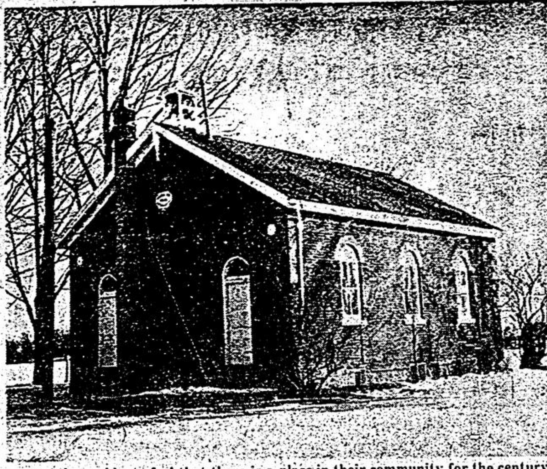
Atha residents feel that there is a place in their community for the century-old schoolhouse, now vacant. It will be retained on a one-year trial basis.