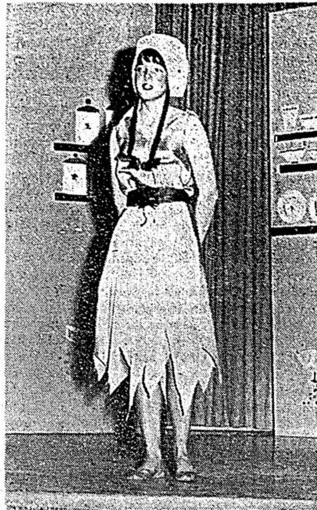
In 'Cinderella' Role