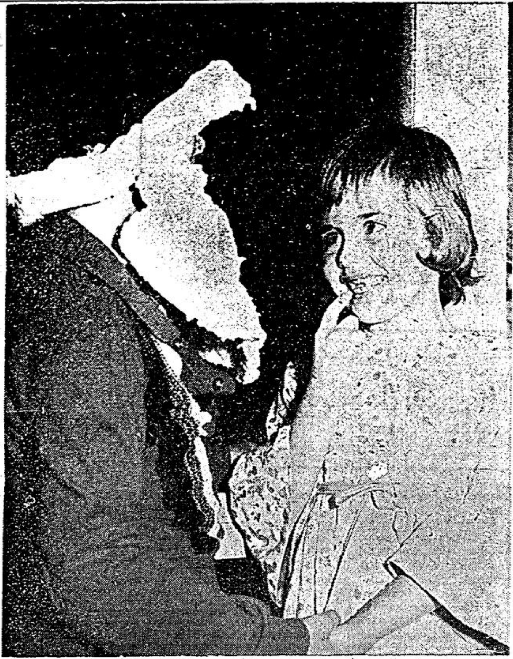
A Few Orders Even Santa Couldn't Fill

In spite of its age, the Atha school is in an excellent state of repair with a modern oil furnace and full washroom facilities.