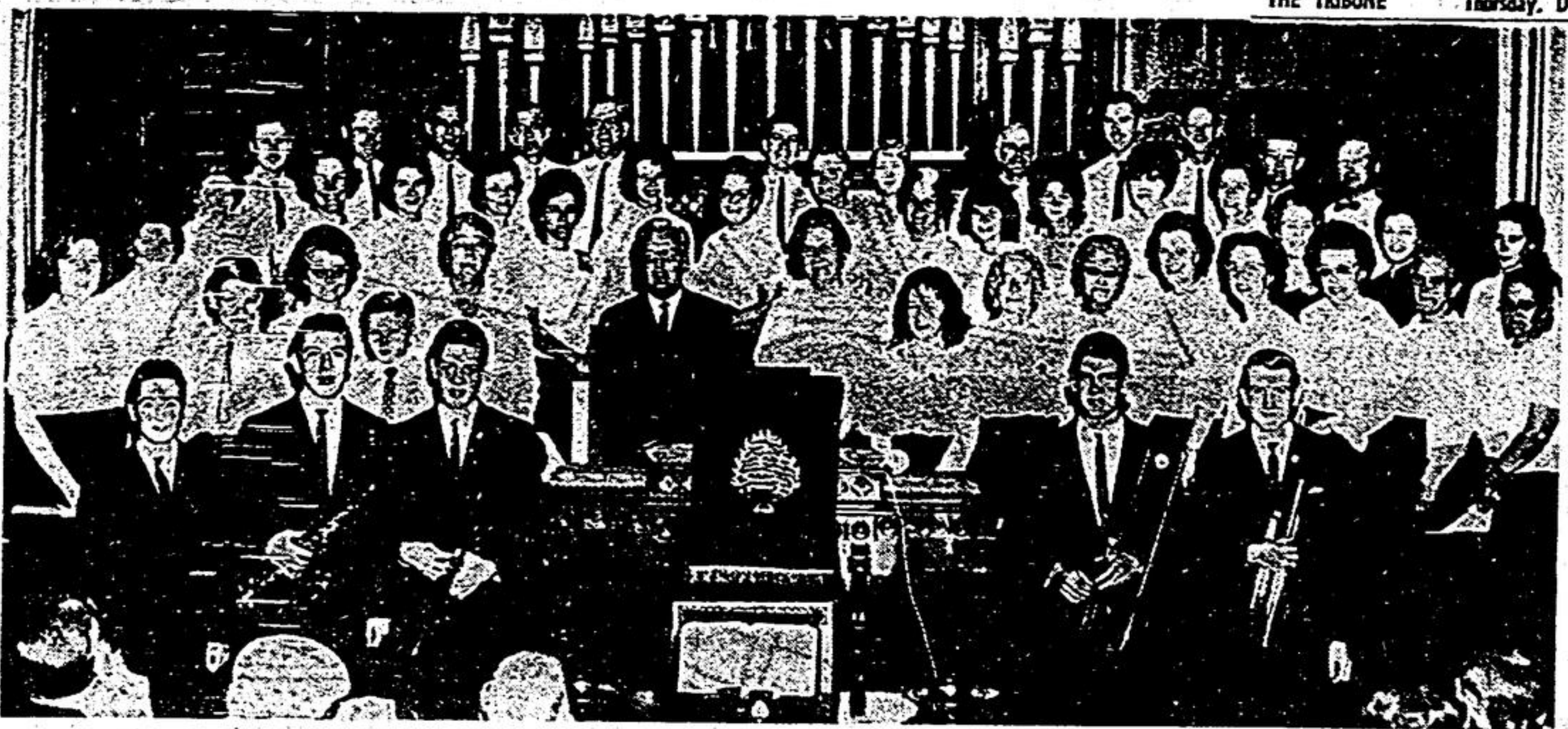
Concludes Successful Evangelistic Campaign

The Christmas meeting of the Women's Institute will be held in the Community Hall, December 14 at 2 p.m. Special guests will be the Senior Citizens with particular emphasis on grandmothers. Each one attending will be asked to tell about a tradition or custom that was practiced in her childhood and which is still being observed today.