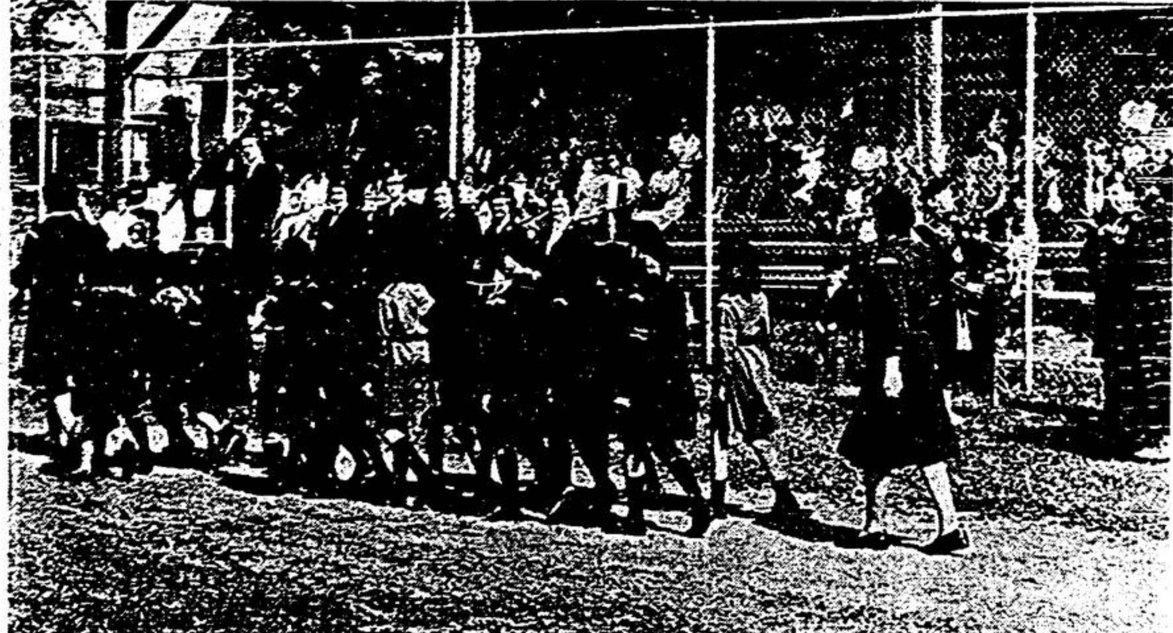
Girl Guides from Markham pass by the reviewing stand.

MORE THAN 300 GIRLS IN GUIDE- BROWNIE RALLY