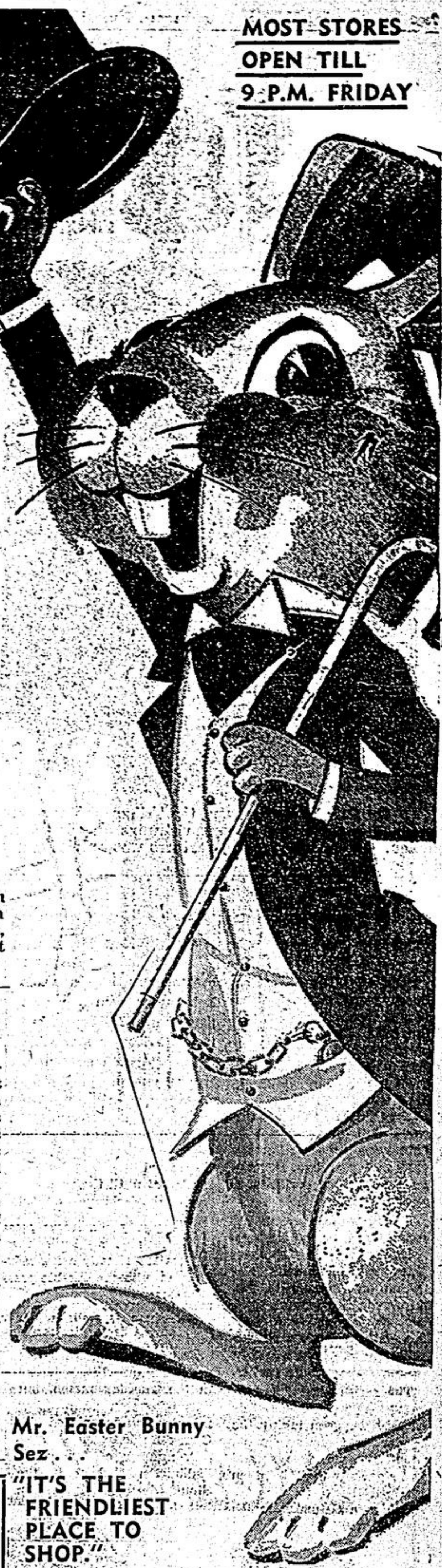
Mr. Easter Bunny Sez...

Young approach to sport coats appears in styles appropriate for either casual or dressier wear. Plaid and solid versions here are fashioned in a polyester and wool blend, with textured effects. The easy-to-care-for fabric is wrinkle-resistant.