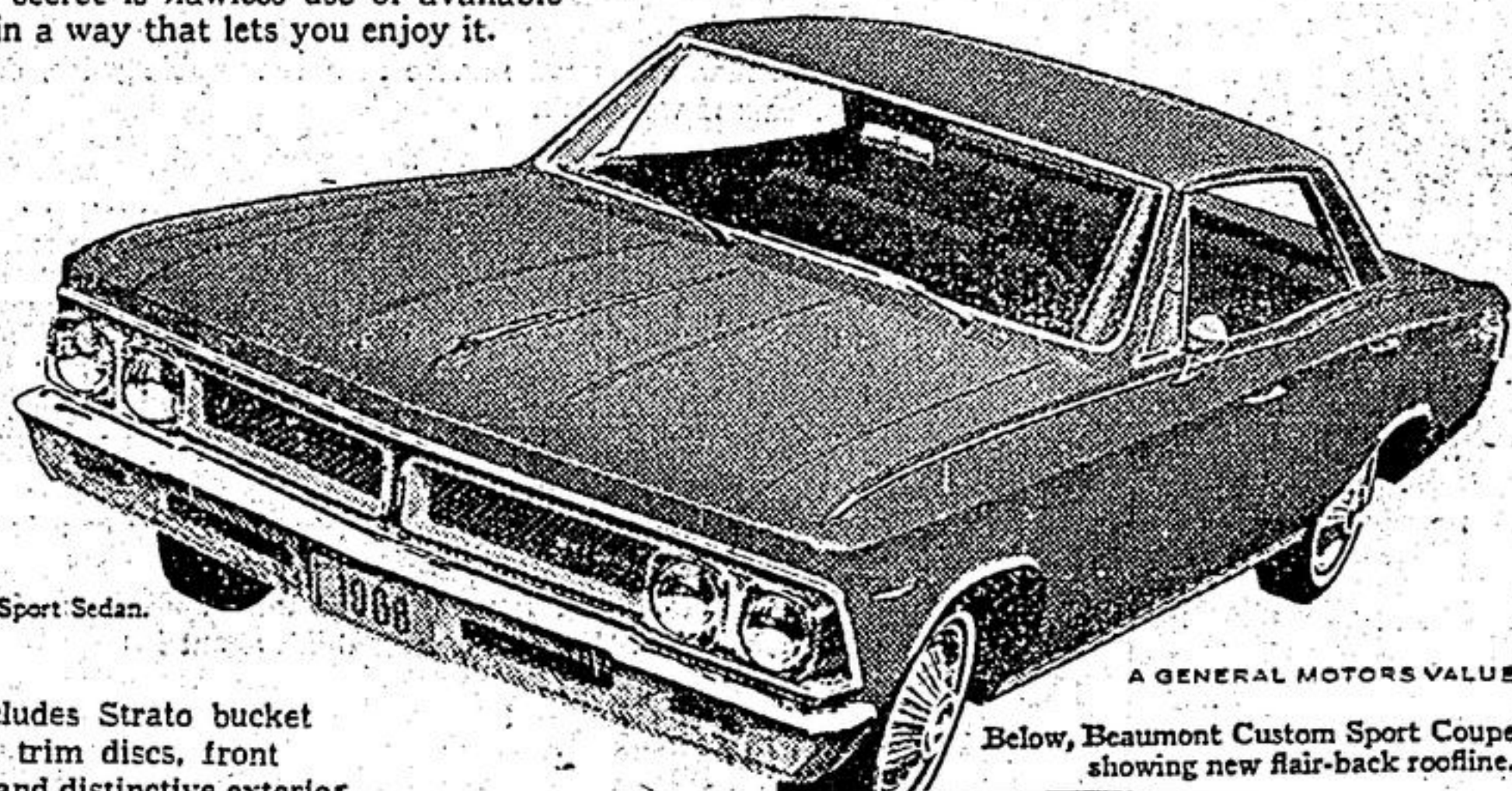
Below, Beaumont Custom Sport Coupe showing new fair-back roofline.

Right Price! Look at Beaumont. Take a long look. All this luxury, eye-stopping style, and the performance to go with it, is priced remarkably low. A 120 hp six or 195 hp V8 is standard, or select a more powerful six or one of two V8s (up to 360 hp with Sports Option*). Transmissions to match. With Beaumont, everything matches.