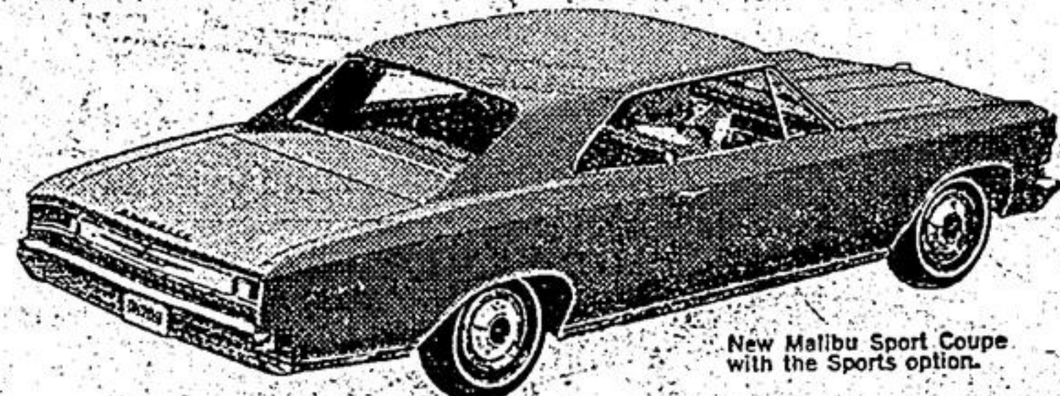
New Malibu Sport Coupe with the Sports option.

New sculptured rear deck, dramatic new rooflines, broad new grille design, powerful new engine range, and Chevrolet's kind of quality are what set '66 Chevelle apart from the pack. But the only way to appreciate a '66 Chevelle is to see it for real. And you can't do that here. The place to go is your Chevrolet dealer's.