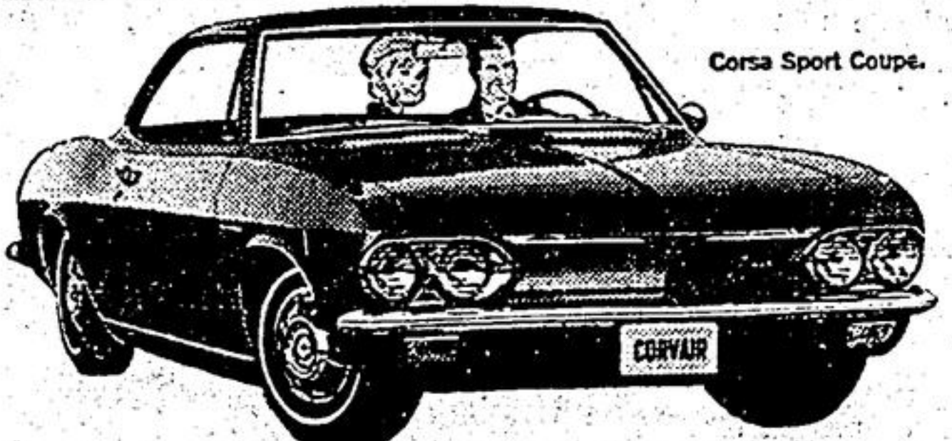
Corsa Sport Coupe.

Corvaire, like all the '66 Chevrolets, has a padded instrument panel, padded sun visors. Seat belts front and rear. Backup lights, windshield washer and 2-Speed wipers, outside rear-view mirror. Fully synchronized 3-Speed transmission. All of it standard equipment. Corsas. Monzas. 500's. Come get one. Stay young.