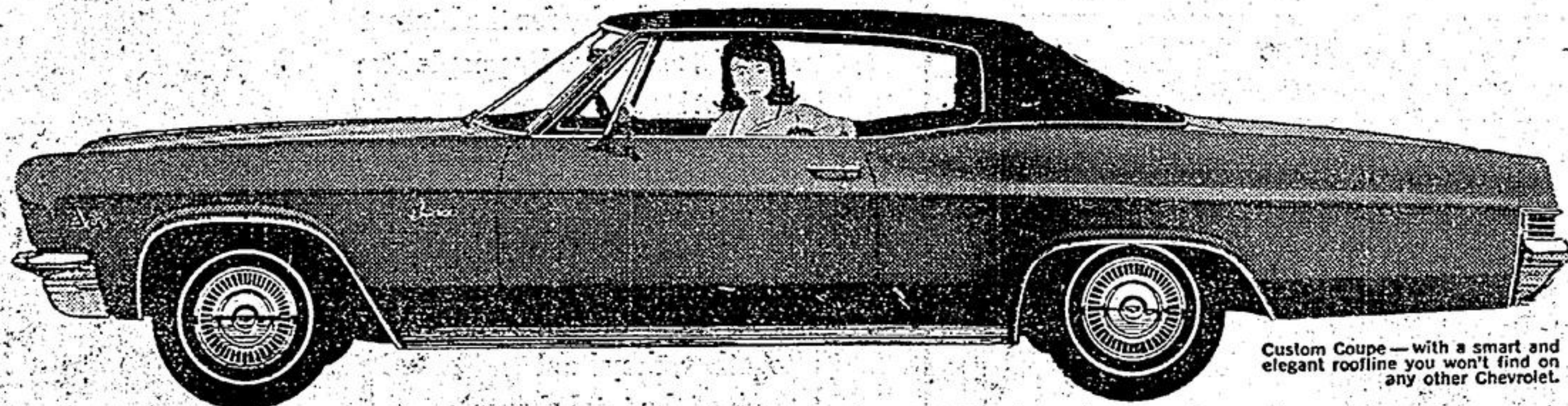
Custom Coupe — with a smart and elegant roofline you won't find on any other Chevrolet.

A whole new series of elegant new models — the most lavish Chevrolet has ever built. There's the Caprice Custom Coupe, Caprice Custom Sedan and the luxurious new Caprice Custom Wagon. Truly elegant in every detail, they invite (and deserve!) your closest inspection.