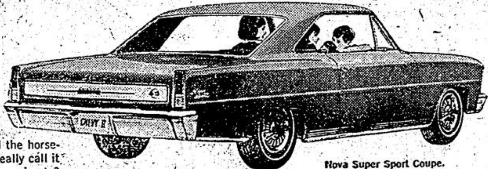
Nova Super Sport Coupe.

Chevy II is something else again for 1966. We've lowered the roof, raised the horsepower available and given it a whole new look. It's so different, we should really call it the Chevy III. What's the economical dependable, salt-of-the-earth Chevy II coming to? A lot of very smart car buyers, the way we figure it.