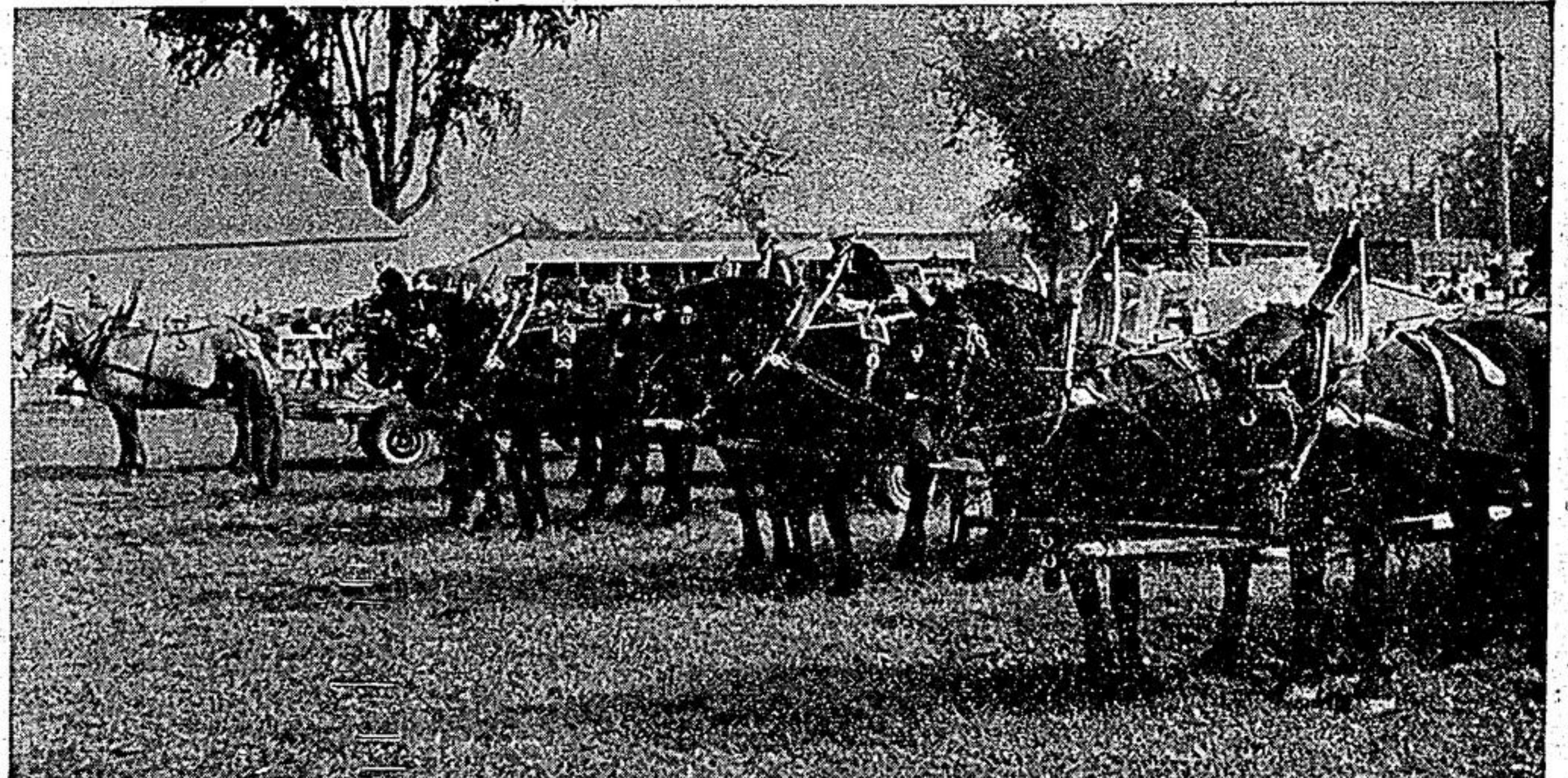
The horse show, both team and single entries was most impressive and attracted much attention. A lineup in the Percheron class is shown here during the judging. The competition was exceptionally keen.