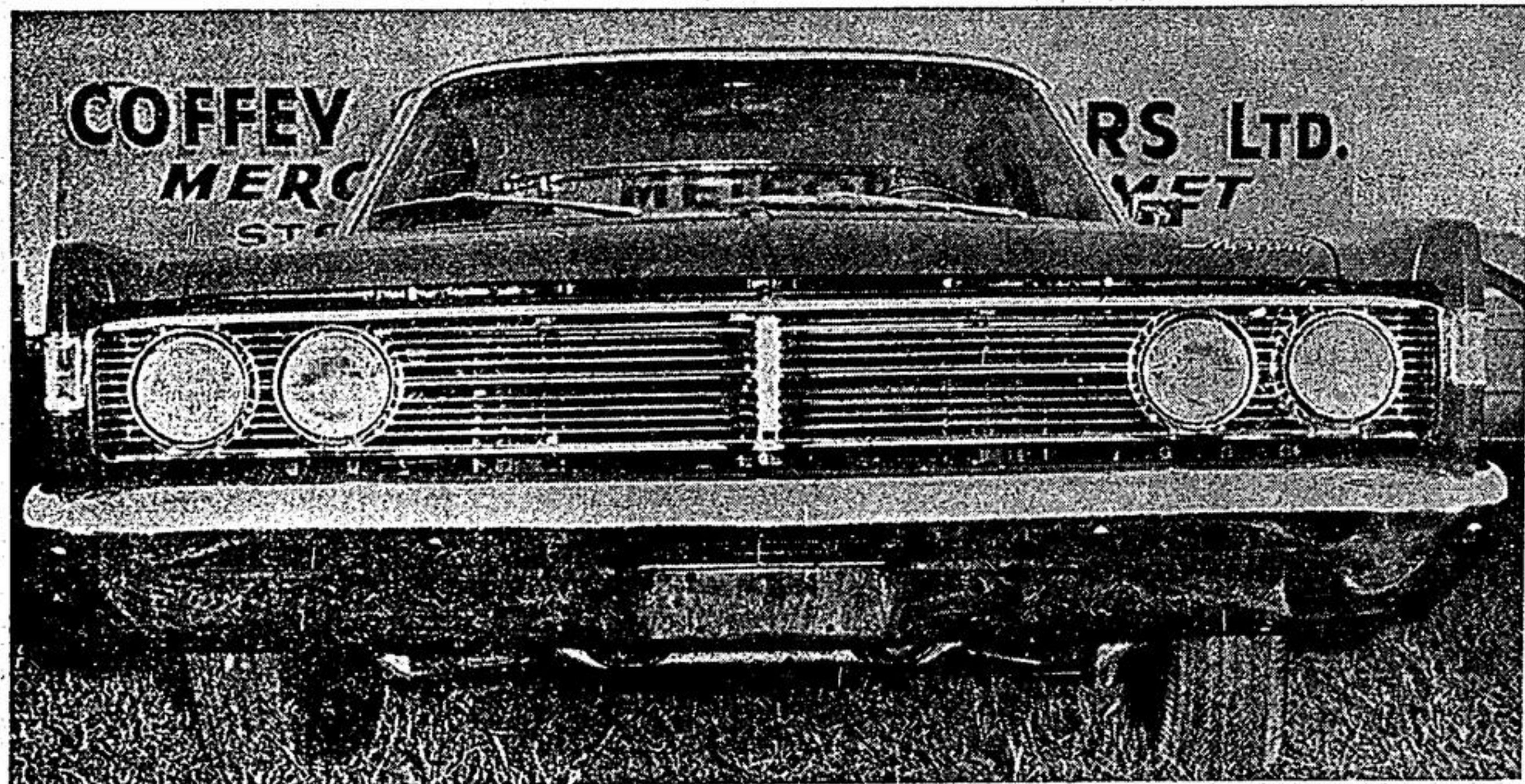
Several local car dealers took advantage of the Fair to display their new 1966 model automobiles. One of these was Coffey and Bartley Motors of Stouffville. The front view of a new '66 Mercury is shown here.