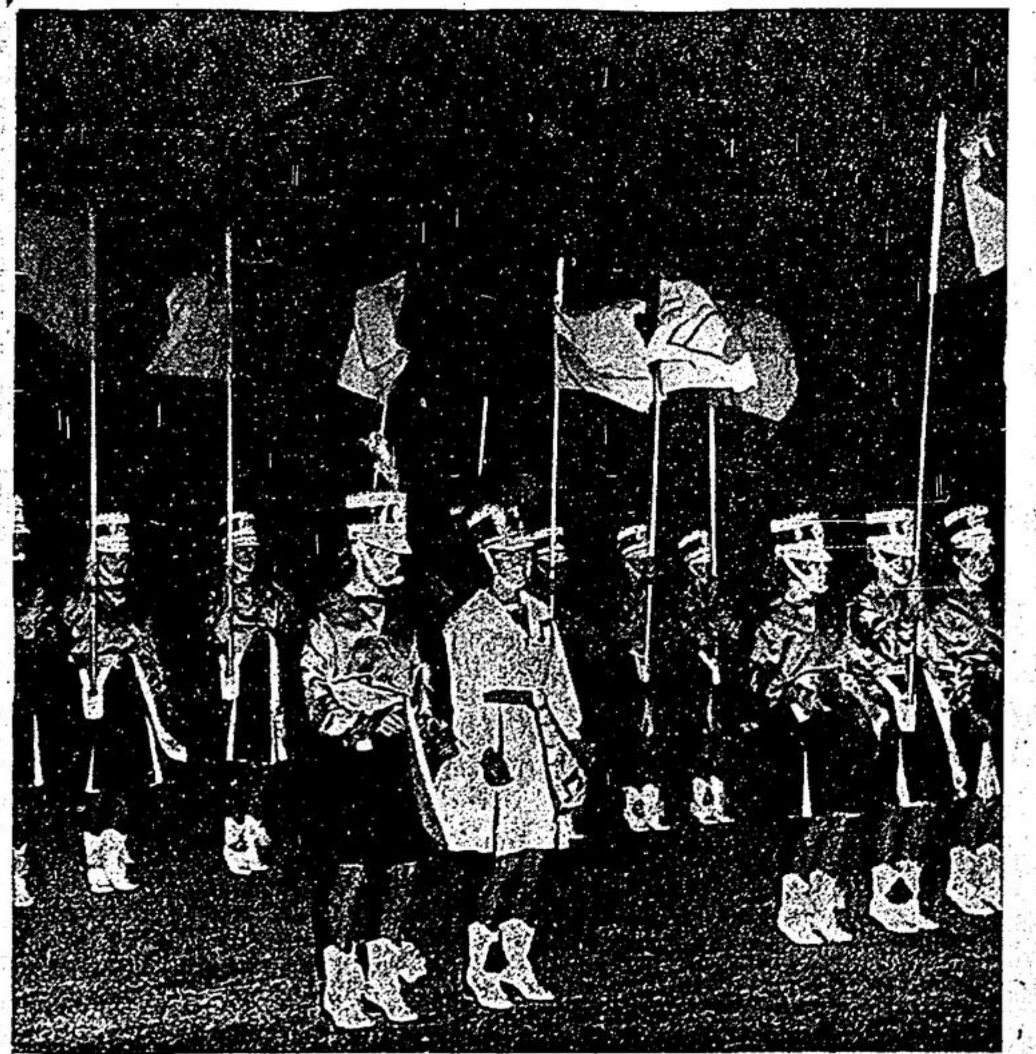
The "Blue Notes" of Pickering, Fair champions in the band competition in two previous years, placed 2nd on Saturday night. Both their music and their drill routine were given a rousing ovation by the crowd. The coloured guard is pictured here. The band concert is now an important part of the Fair program.