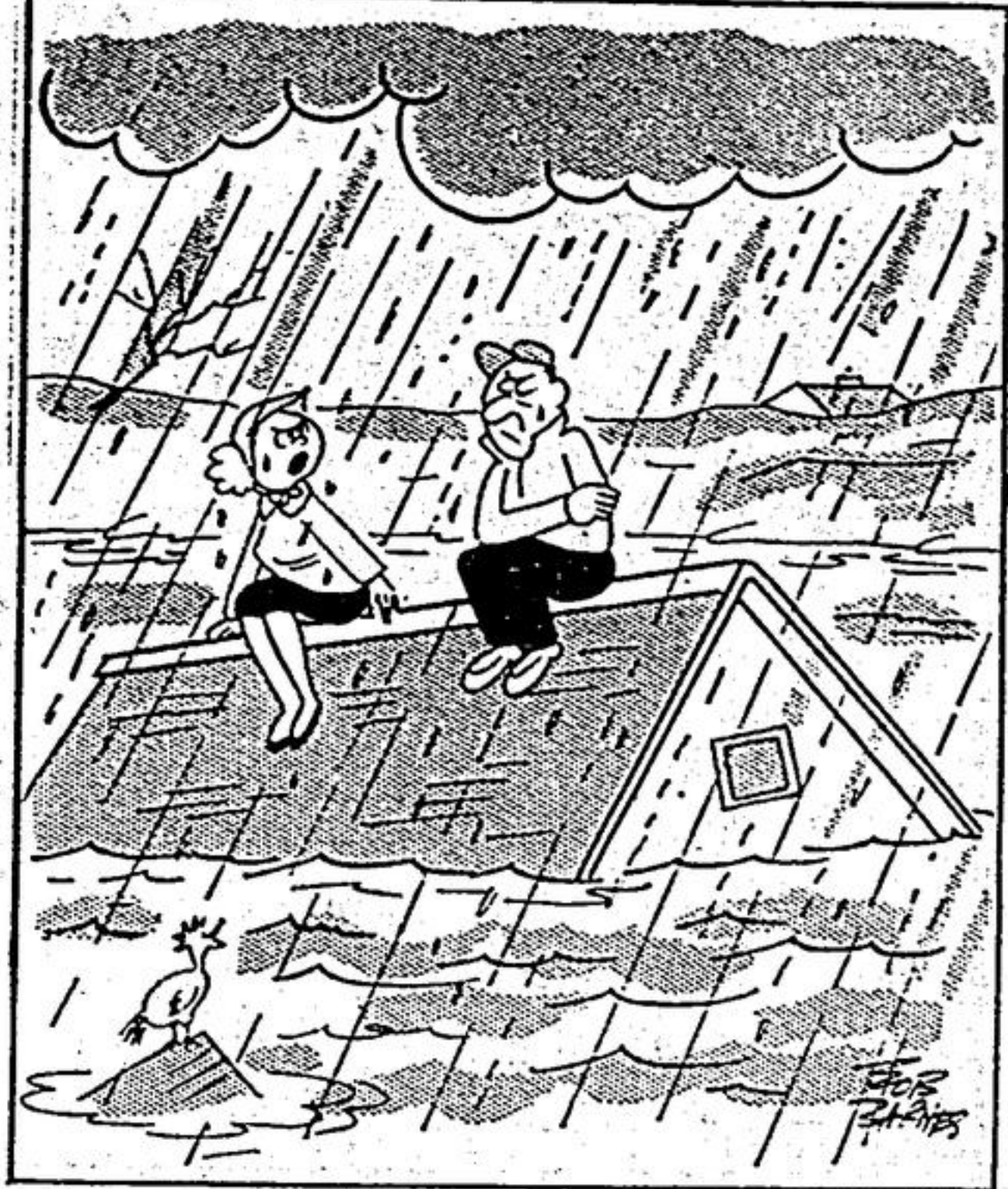
"This does NOT take the place of our vacation trip this year!"