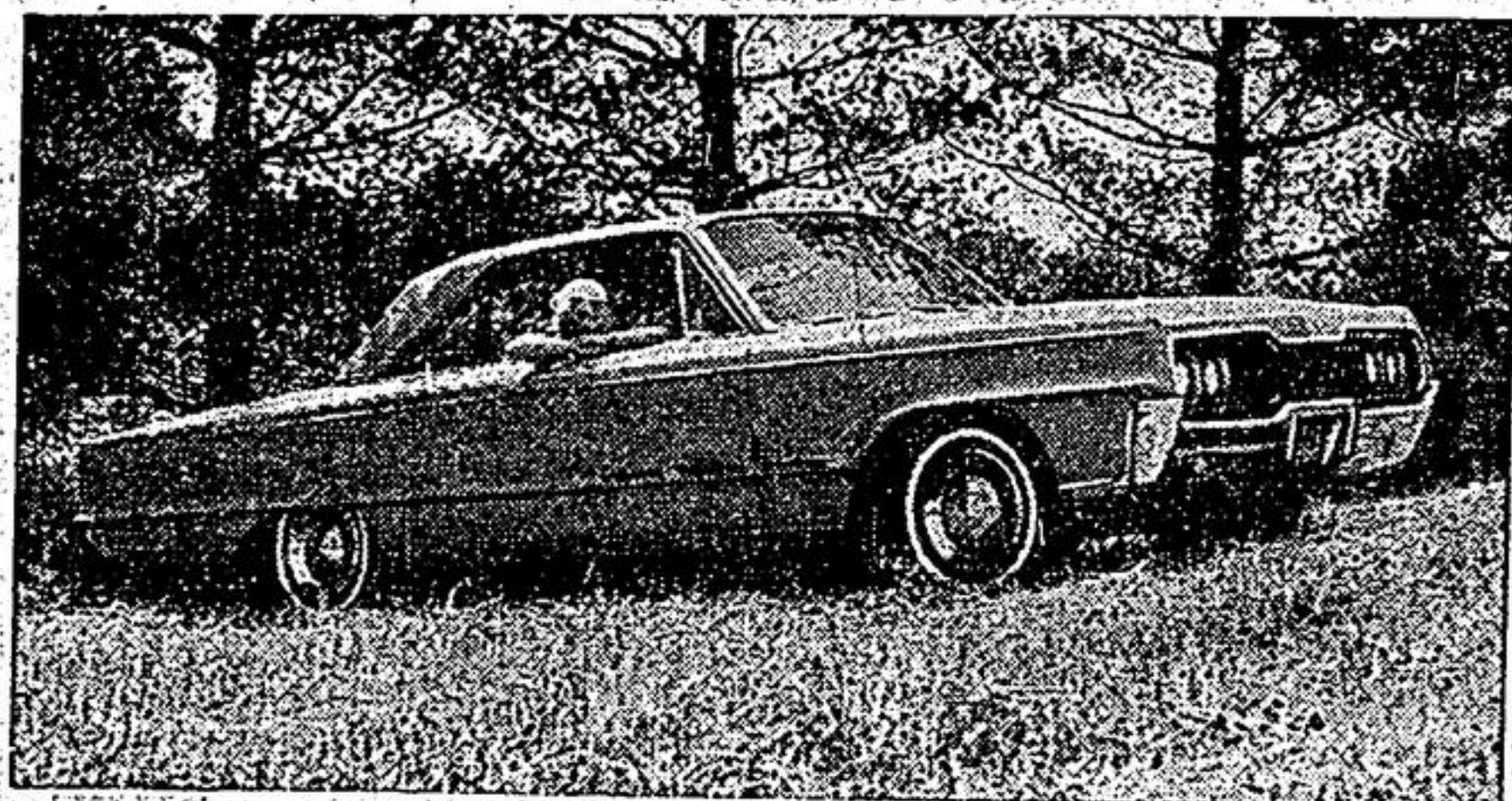
1966 DODGE MONACO 2-DOOR HARDTOP

SEE and TEST DRIVE THIS YEAR'S 2 COMPLETELY ALL NEW MODELS