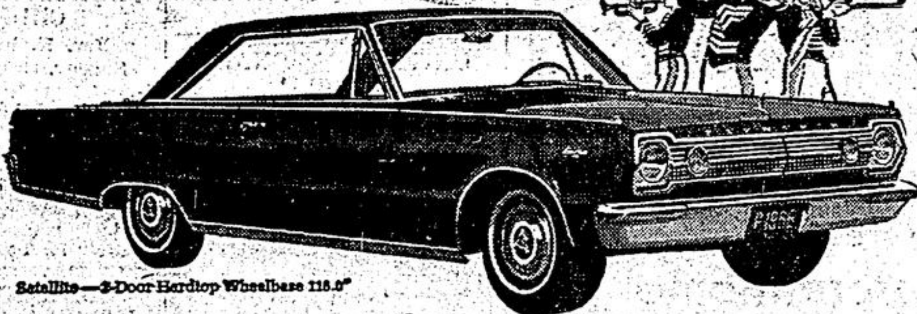
Belvedere - 4-Door Hardtop Wheelbase 118.0"

Beautifully-styled outside, big and spacious inside, Fury offers a wide range of models plus a power choice of four proven engines - 'six' and V-8. In '66, nothing goes like Fury!