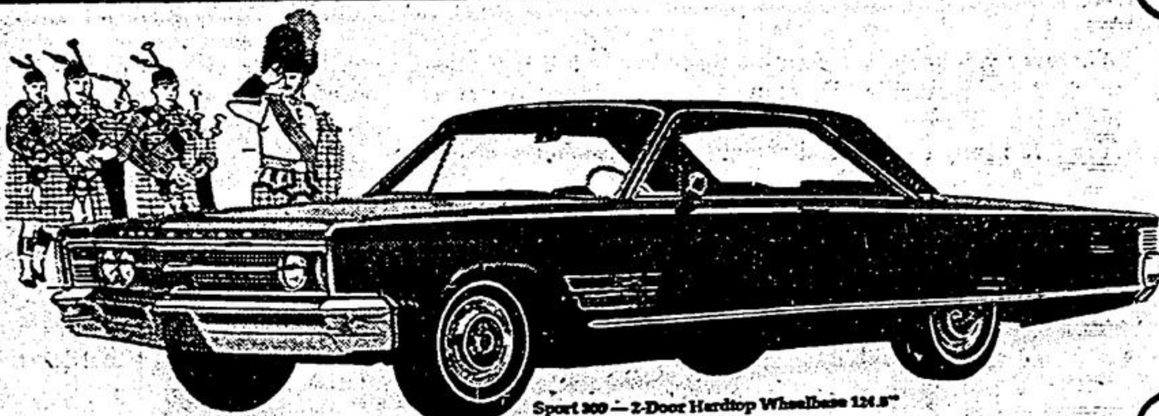
Sport 300 - 2-Door Hardtop Wheelbase 124.0"

Move up to the beautifully distinctive '66 Chrysler. You get features like the Auto-pilot, reclining seats with built-in headrest, a great range of high-performing engines. See the brand-new Chrysler Sport 300, the new Town and Country station wagon series. Move up - enjoy the Chrysler way of life!