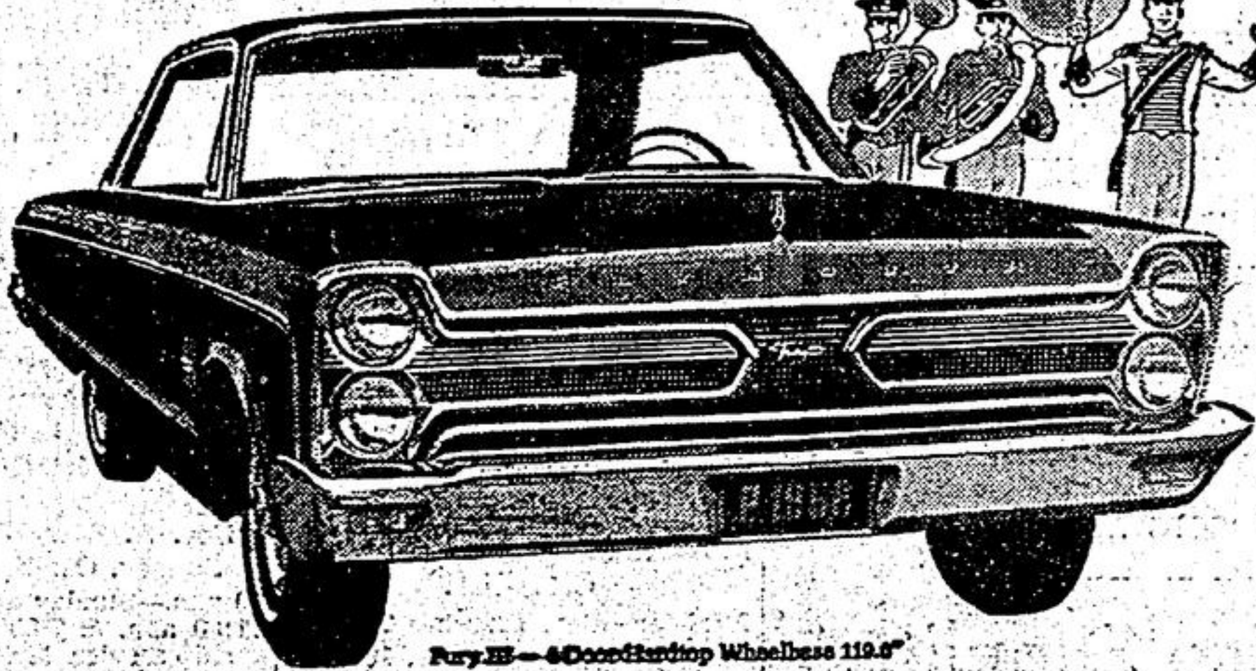
Fury 28 - 4-Door Hardtop Wheelbase 112.0"