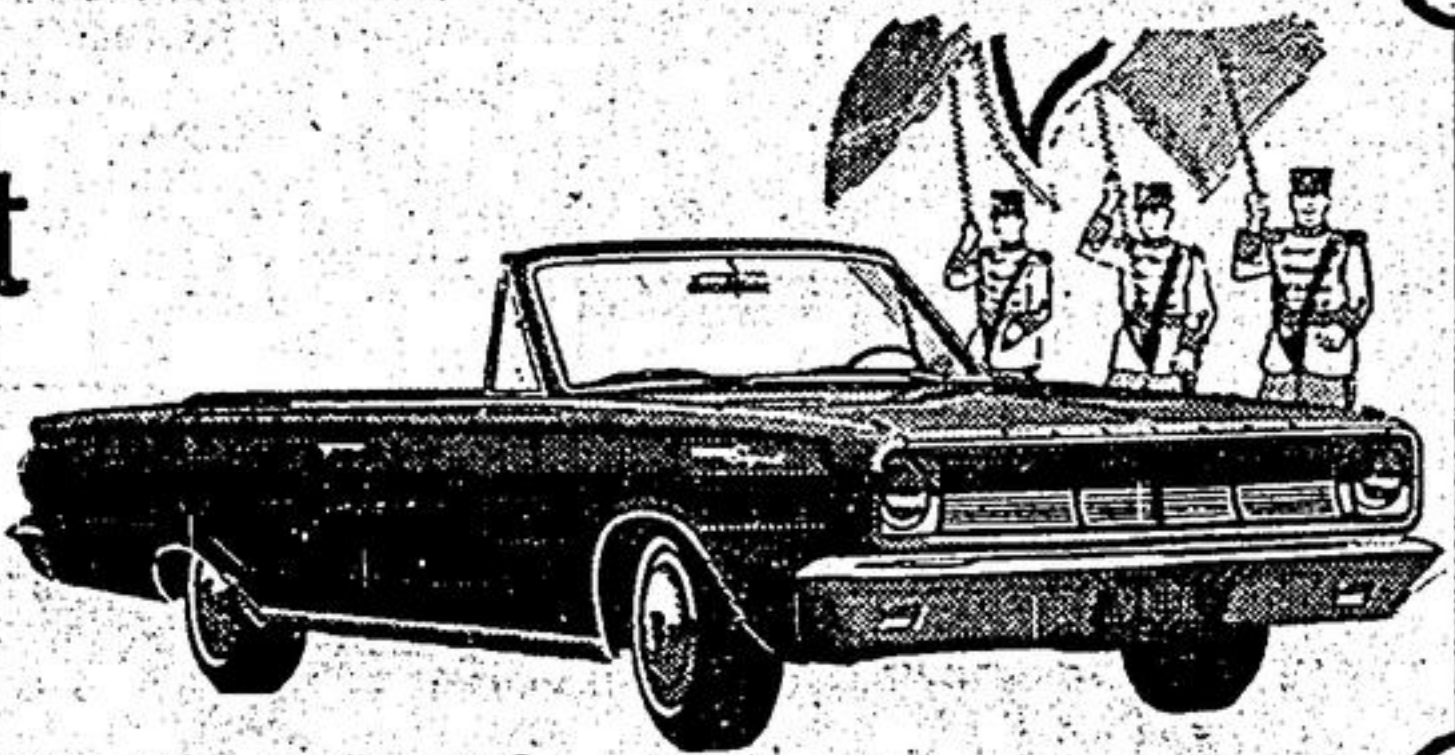
Signet Convertible - Wheelbase 111.0"

Nobody beats Valiant for value... style, comfort, roominess, economy, low initial cost make Valiant the Value Leader for '66.