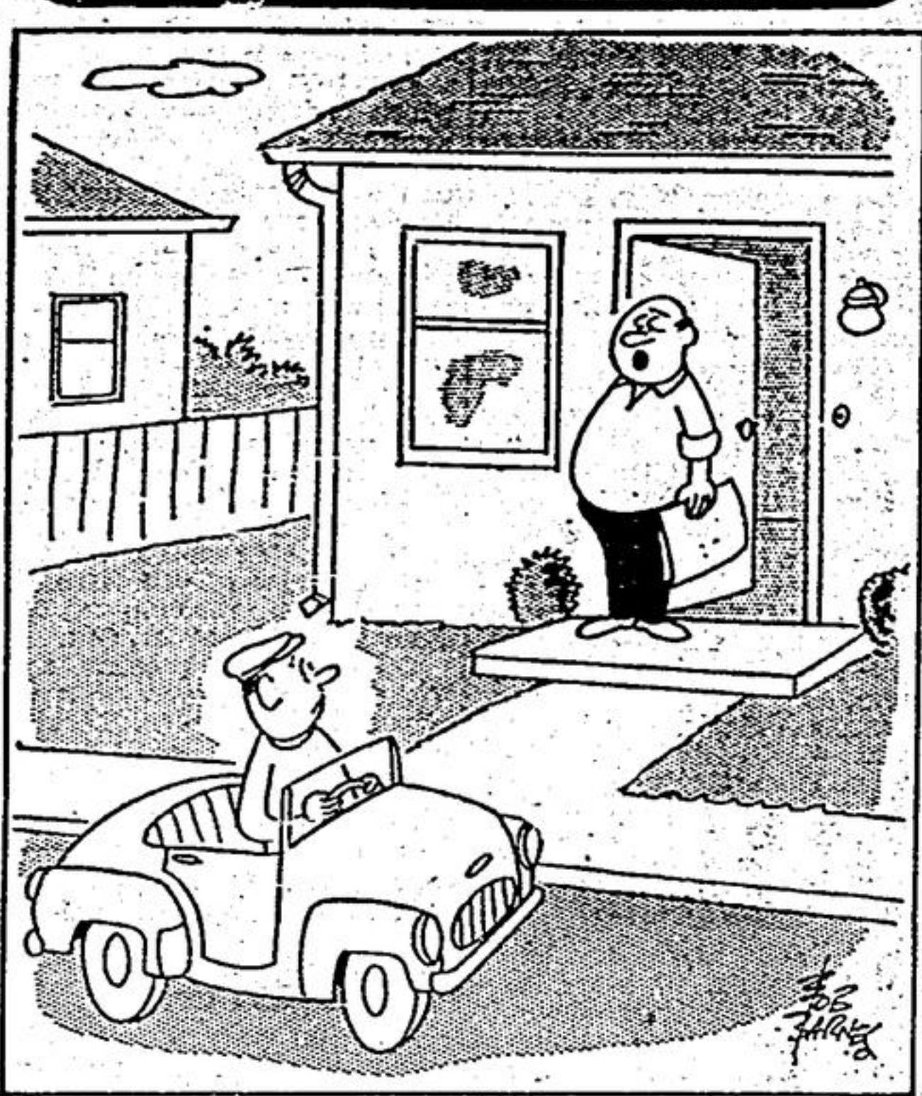
"She'll be ready in a minute—why don't you take your car off and come in and wait?"