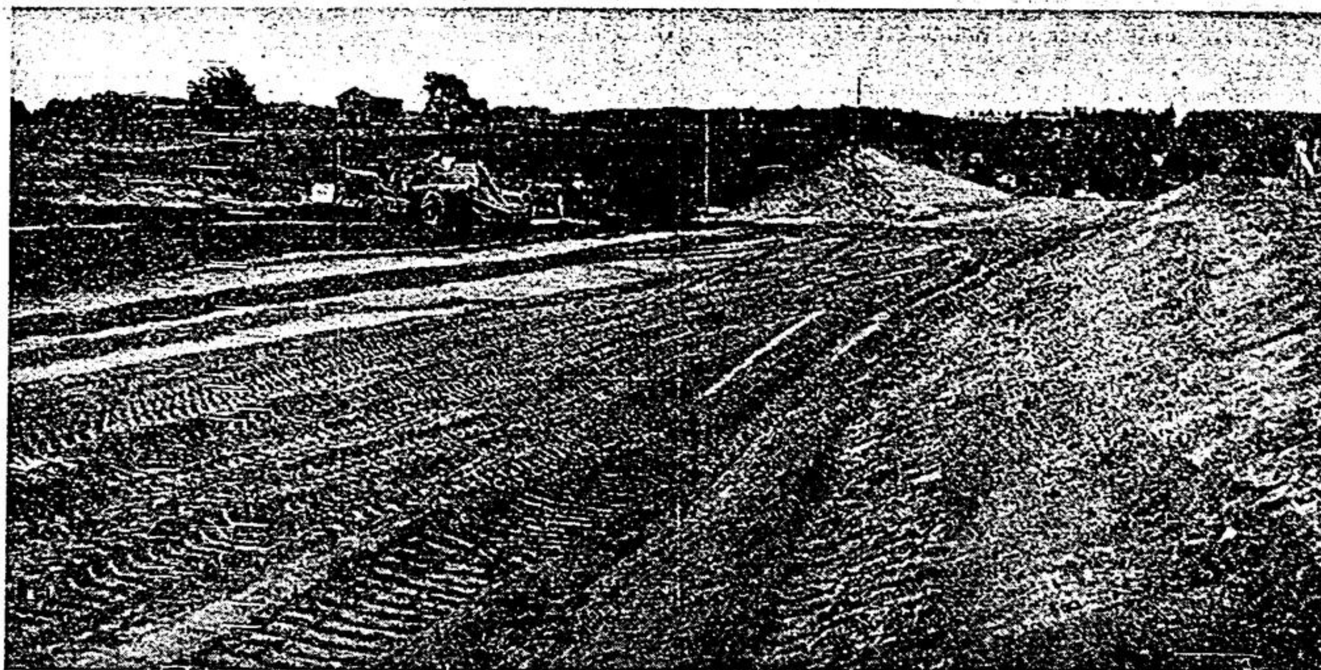
This scene is looking south towards Island Lake. The project covers a 1 1/4 mile section. Steep hills are being removed and the valleys levelled off with fill. The project will be completed this fall.