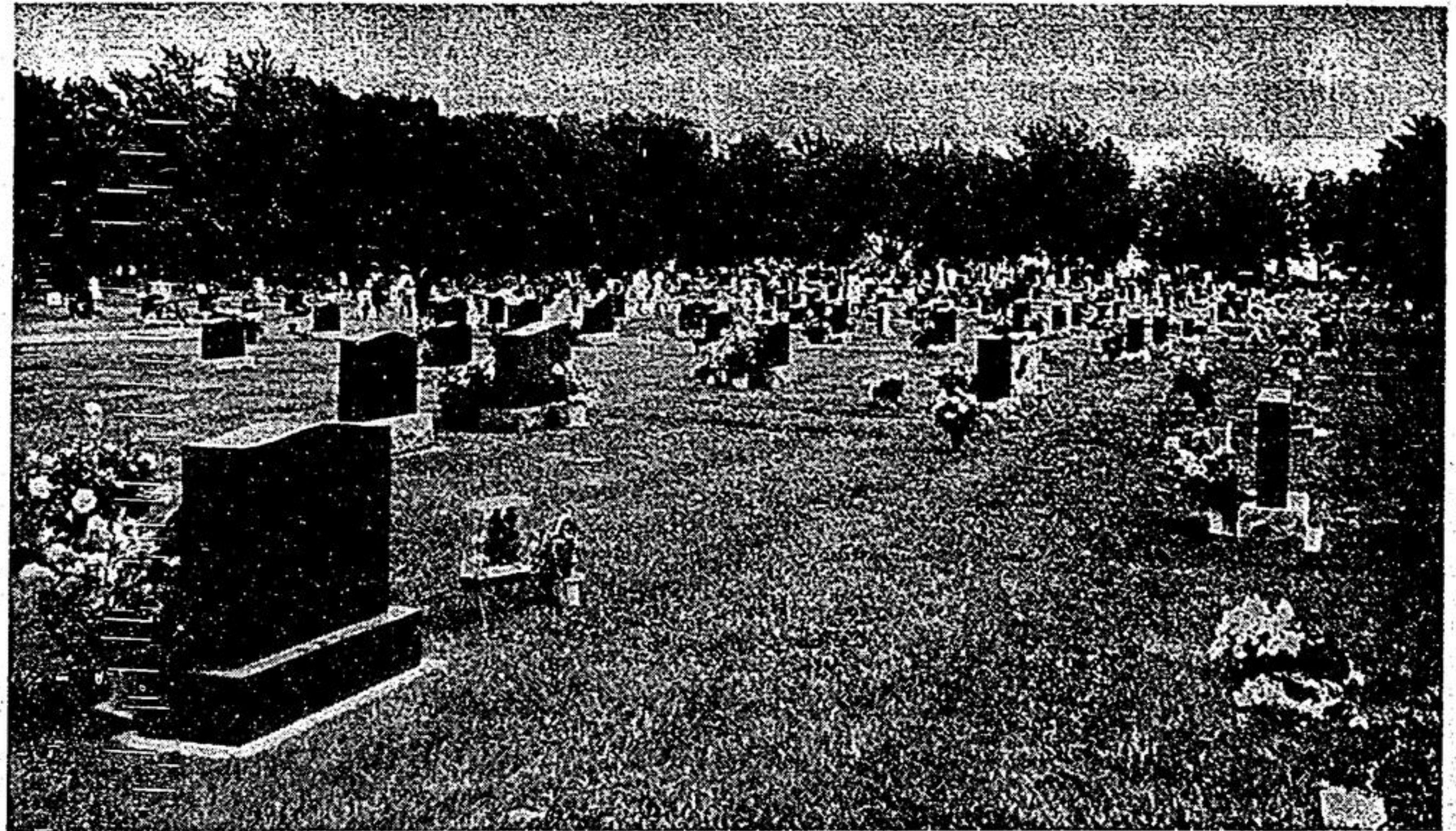
The cemetery grounds appeared well kept and the graveside flowers were most beautiful.