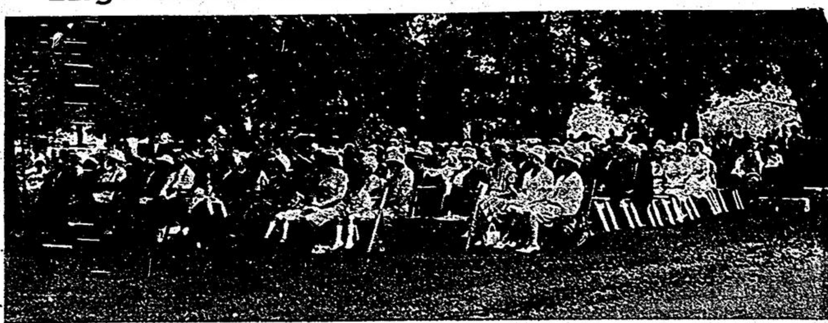
A large crowd attended the Decoration Day service in the Stouffville cemetery on Sunday afternoon. Reverend Gordon Gooderham of the Baptist Church addressed the gathering.