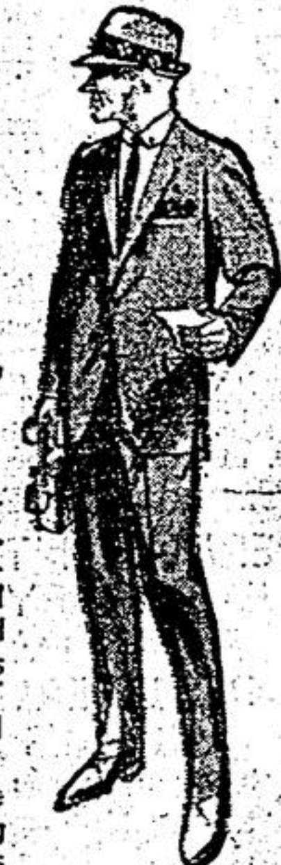
"They'll Never Guess You Paid So Little"

Men! Enjoy maximum foot-wear pleasure this summer. Get a pair of all leather summer weights with ventilated vamp and sides. Be cool and correct in this classic dress style shoe. Select black and white, all black or all brown. Enjoy the comfort of this shoe — the meticulous detailing and built-in quality. Get yours today! Pair ..... 12.95