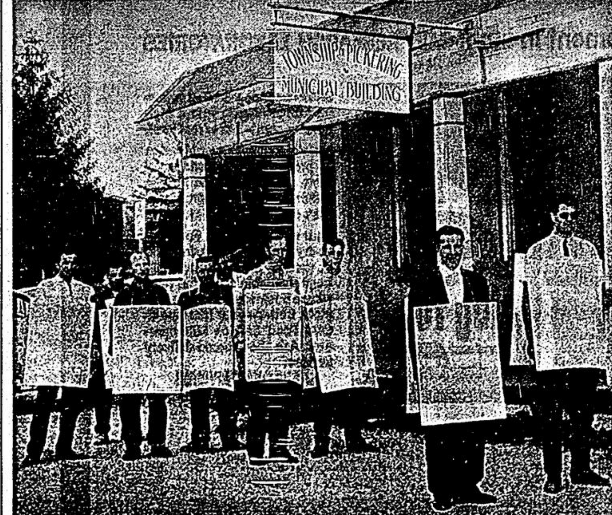
The awarding of a road-construction contract in the Twp. of Pickering to a non-union company, has resulted in a daily picket parade in front of the Municipal Building in Brougham. It is said that workmen are being paid 70c per hour below the union rate. No incidents have been reported.