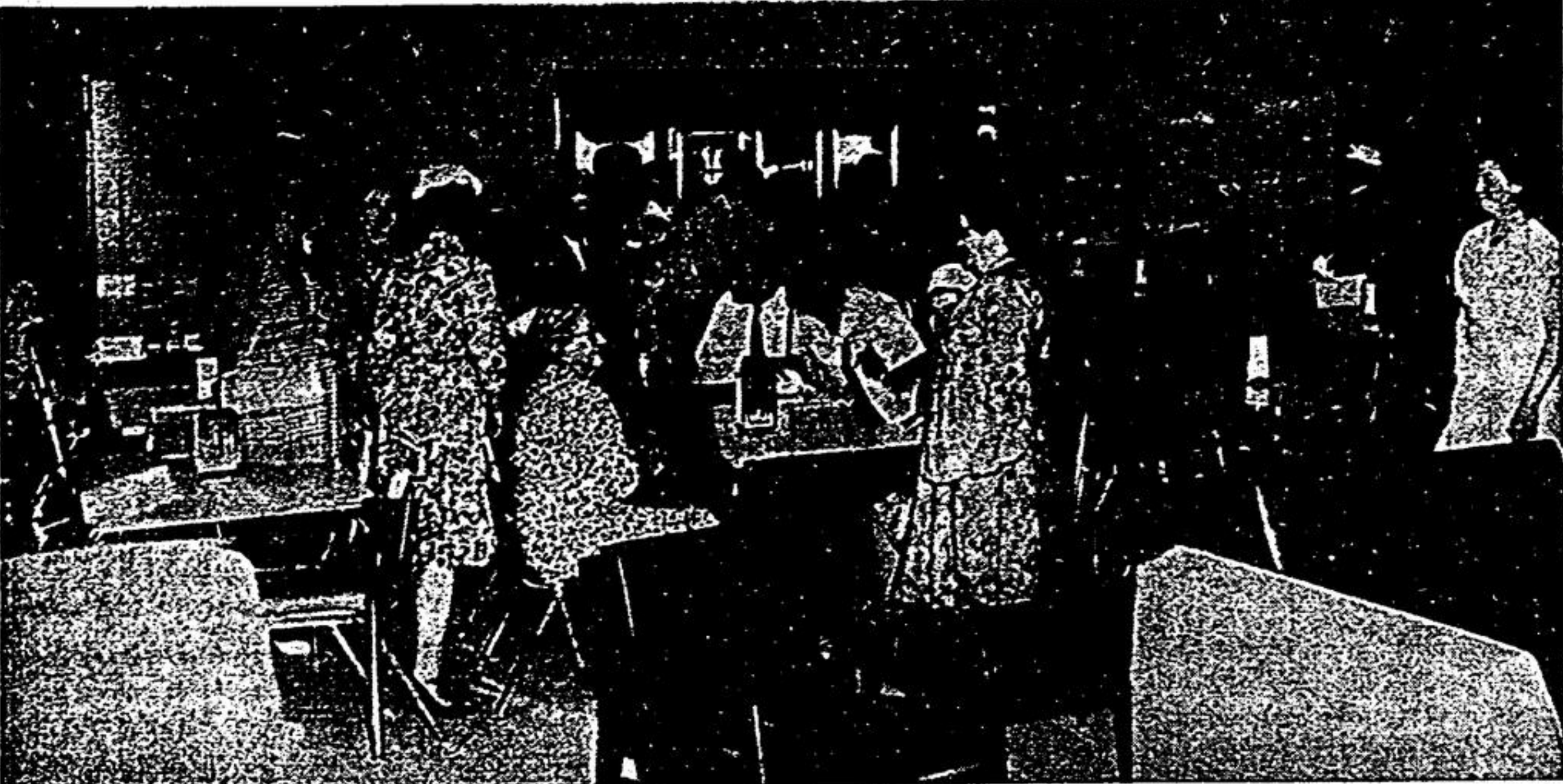
A dining and sitting room is conveniently located next to the kitchen in the new Parkview Sr. Citizen's Home. Meals, where possible, will be provided on a cafeteria style basis in pleasant surroundings.