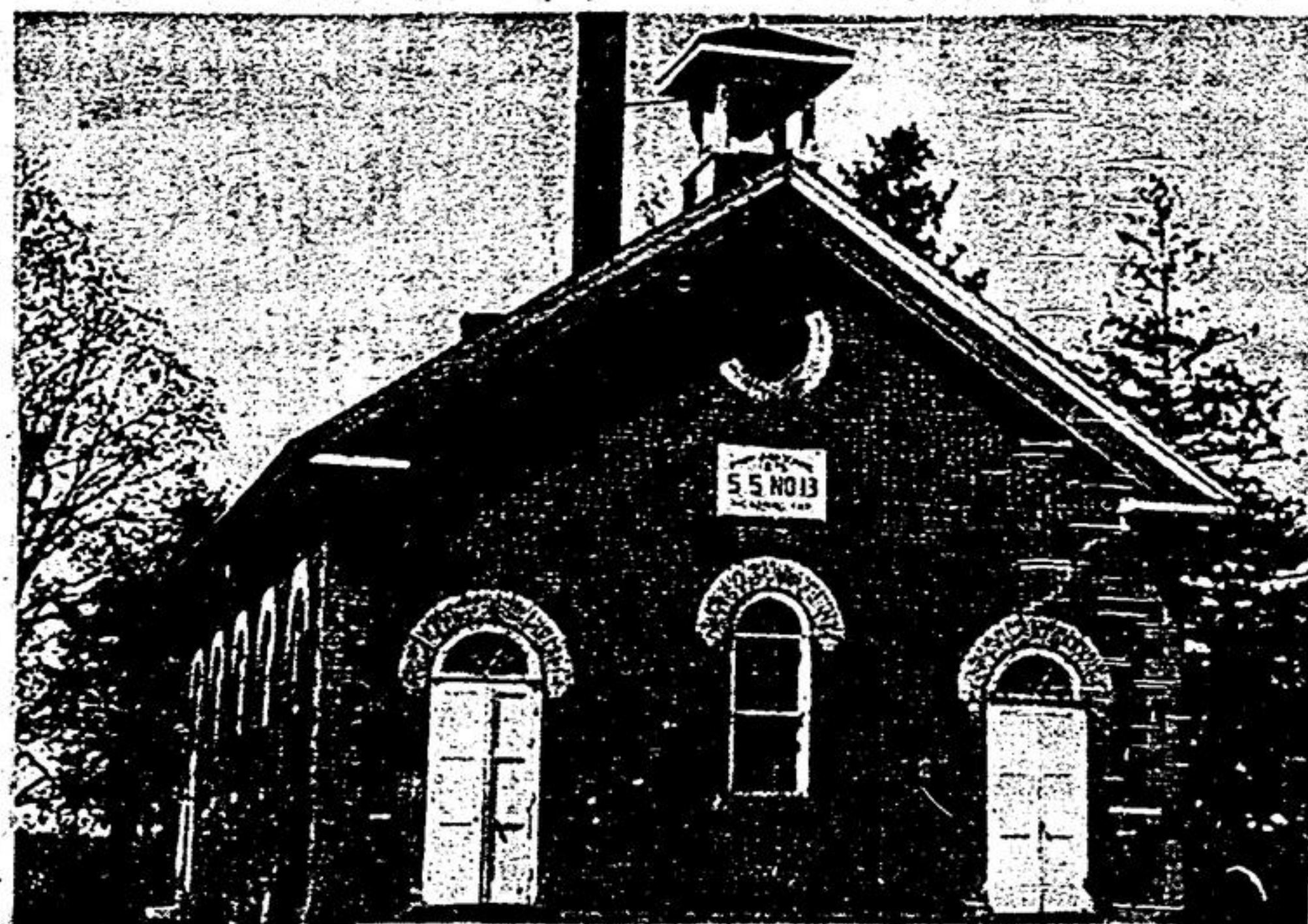
At the conclusion of the June term, two school buildings in Area No. 1, Pickering Twp. will close their doors, possibly forever. One of these is No. 13 at Mt. Zion, erected in 1875. The pupils will be transported to Greenwood, a move that was favoured by the ratepayers.