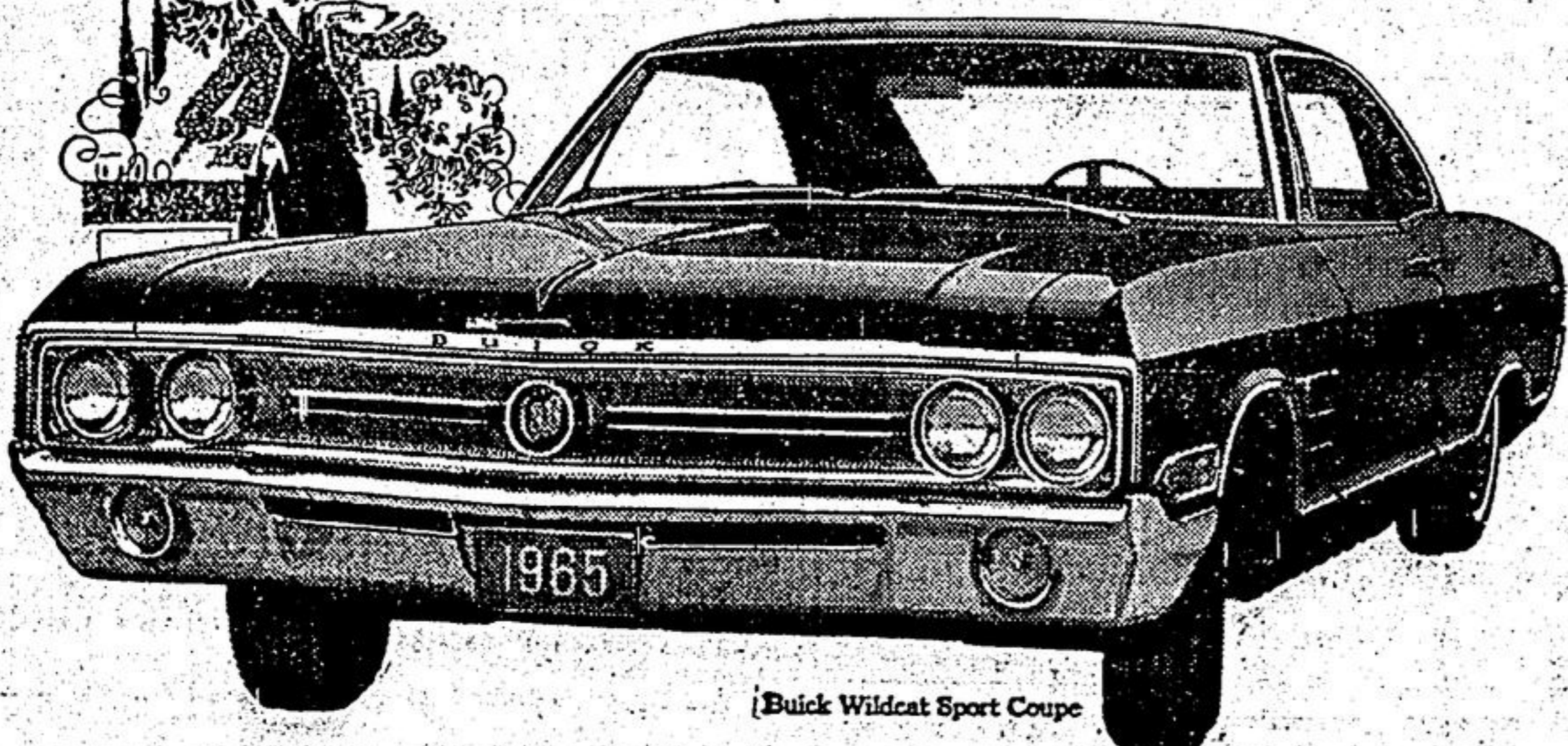
Buick Wildcat Sport Coupe

Like your luxury in trim packages? Then Buick Special is the car for you. Special, Special Deluxe, Sportwagon or Skylark, each model delivers everything that the name Buick promises.