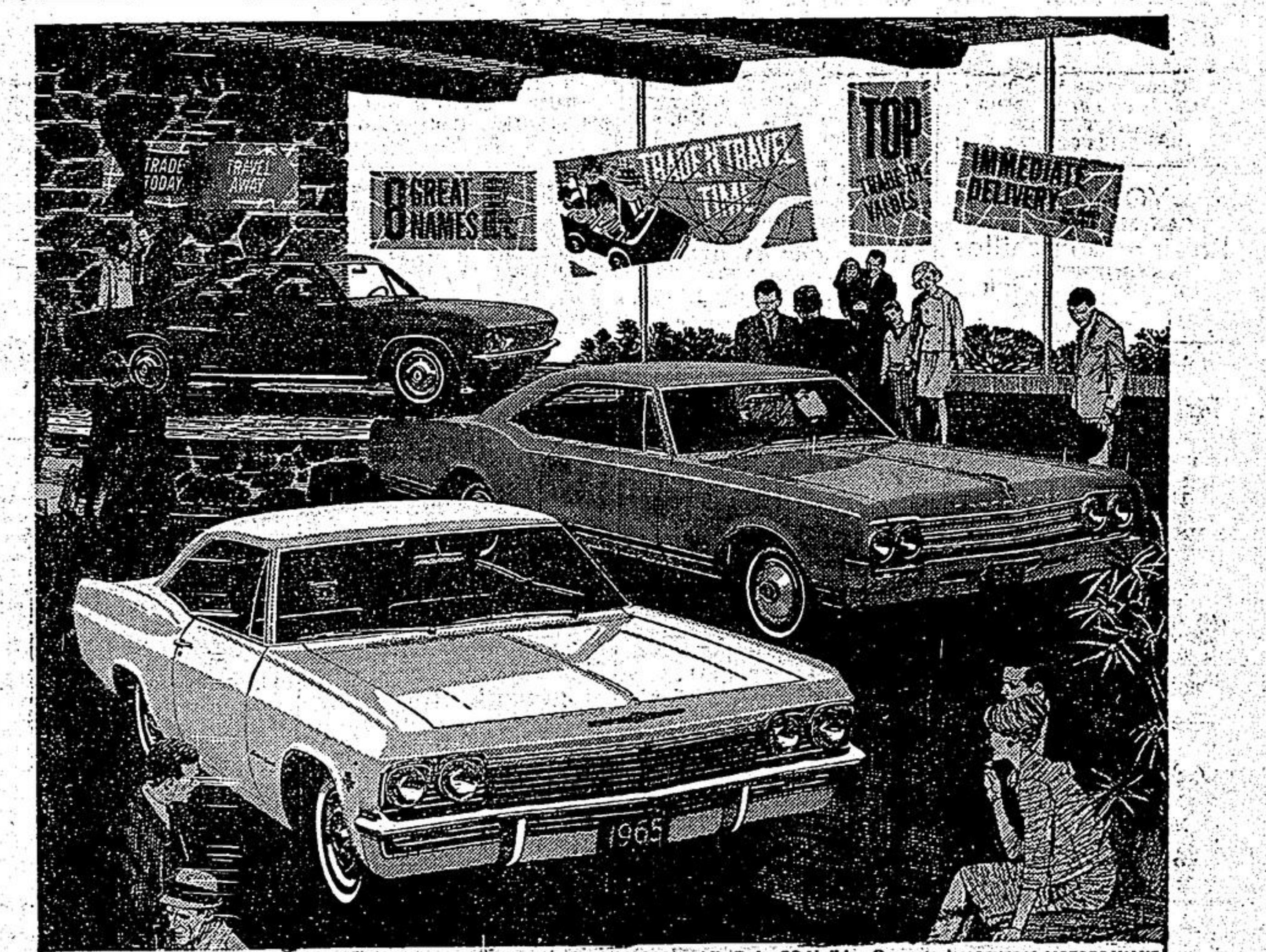
Corvair Monza Sport Coupe Chevrolet Impala Super Sport Coupe Oldsmobile Delta 88 Holiday Coupe | A GENERAL MOTORS VALU