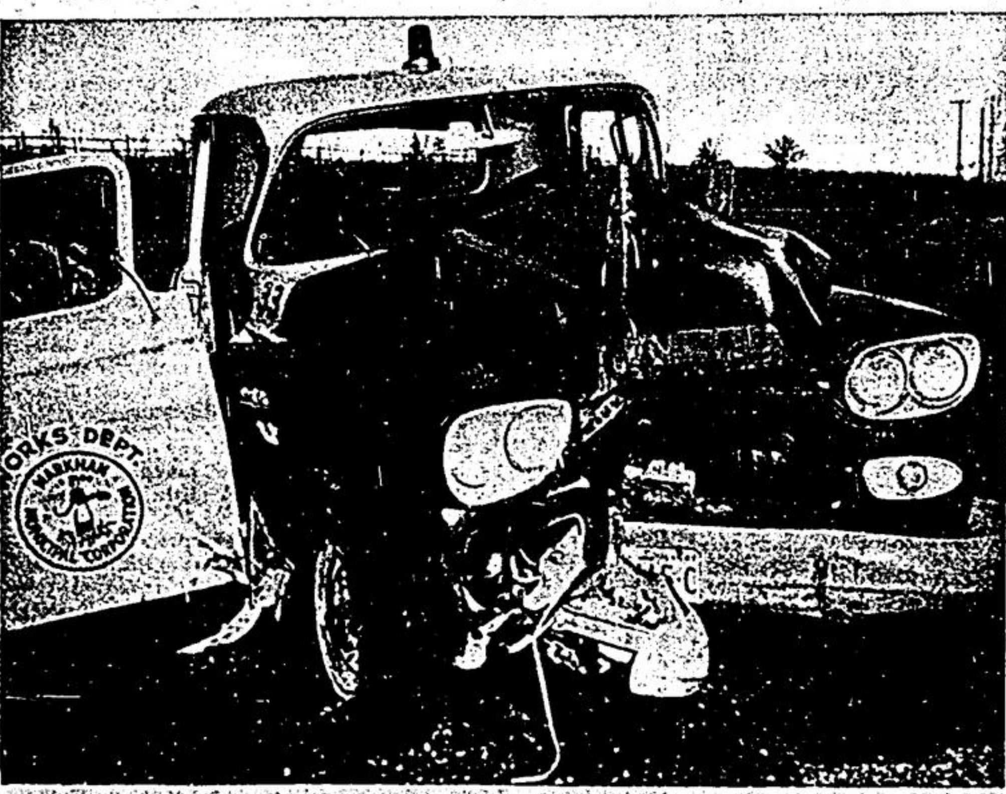
Markham Twp. Road Foreman, Trainer Canning, had a narrow escape from serious injury recently when his light pick-up truck was in collision with another vehicle, then crashed into a building. The force of the initial impact knocked the employee out of the cab onto the road. The truck kept on going with no one at the wheel.