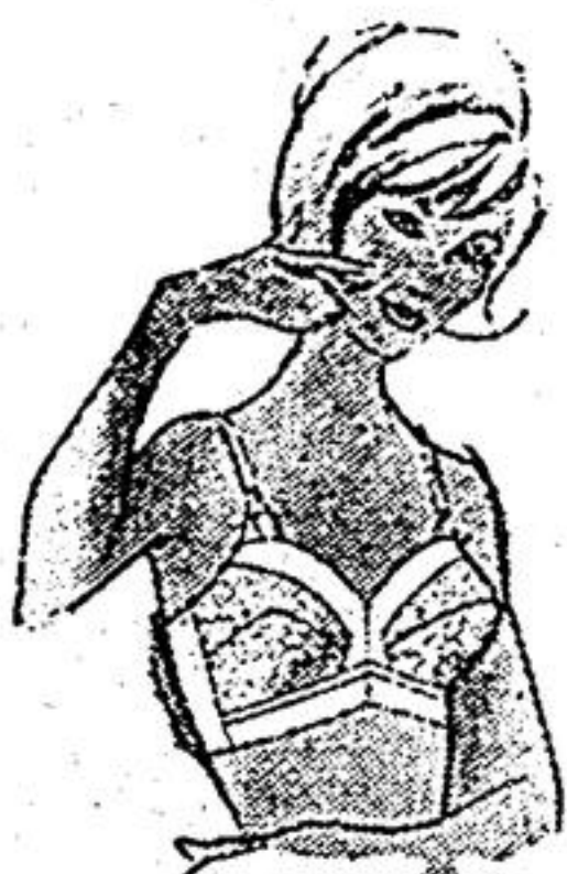
SAVE $1.01 Playtex Cotton-Pretty* Bra with embroidered cotton cups. White, in sizes 32A-40C. reg. $2.50 each NOW 2 for only $3.99

Save up to 25% on Best-Selling Playtex Bras