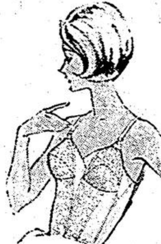
Playtex Living Long-Line Bra reg. $6.95, NOW $5.95 White, sizes 31B-40C.

Save up to 25% on Best-Selling Playtex Bras