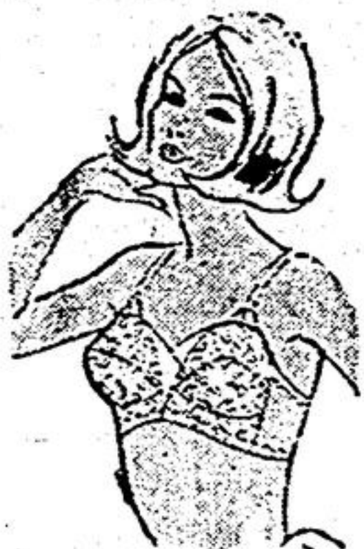
Playtex Living Bra with cotton-lined lace cups. White, in sizes 32A-40C. reg. $3.95, NOW $3.29