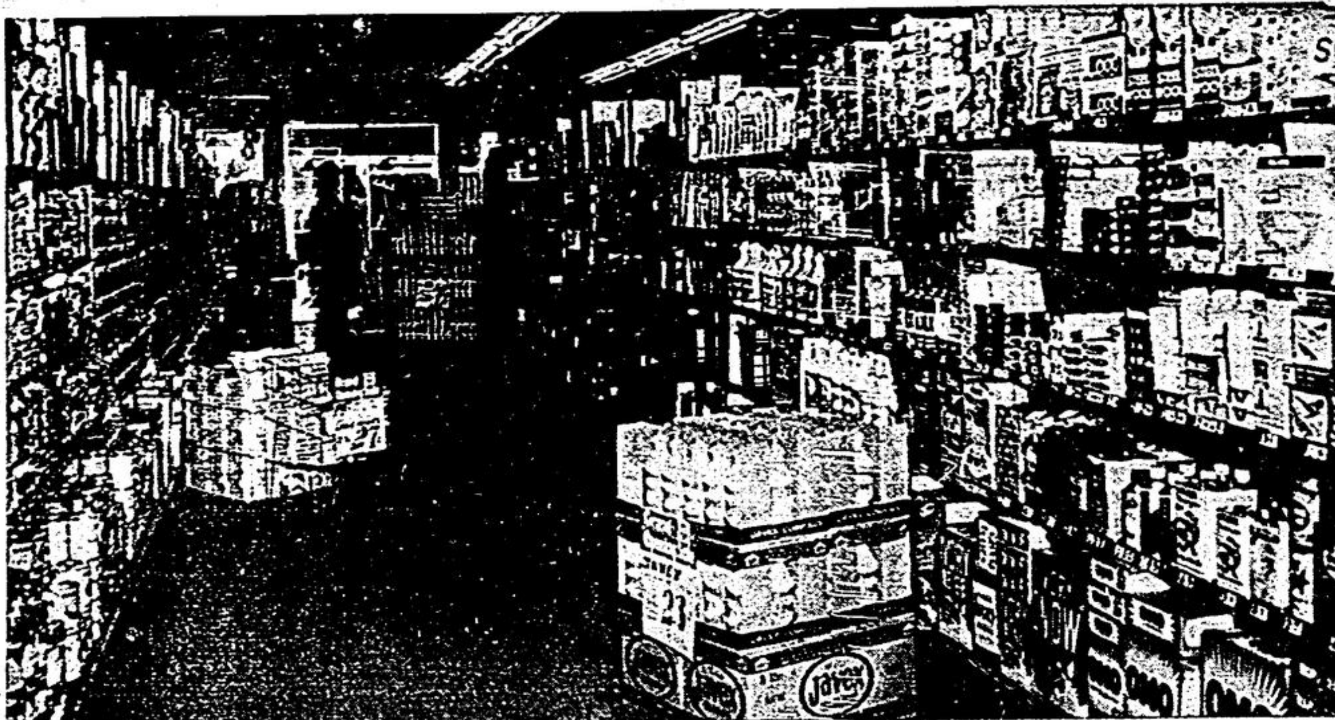
Well-stocked shelves that included many bargain buys, attracted public patronage to Schell's Food Market Store now under the Red and White chain banner, on Thursday and throughout the week.