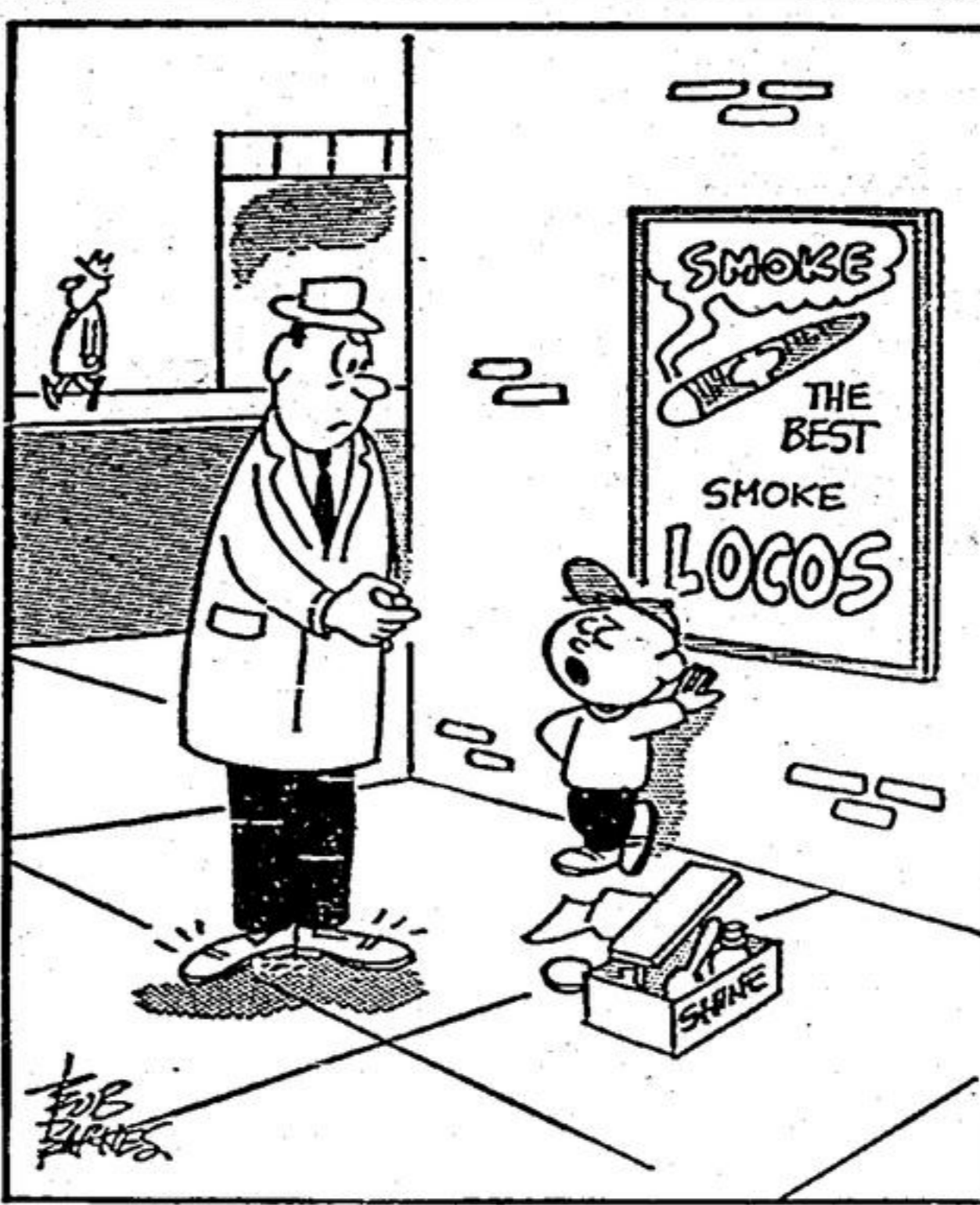
"Sorry mister—but my union won't allow me to accept tips under a dime."