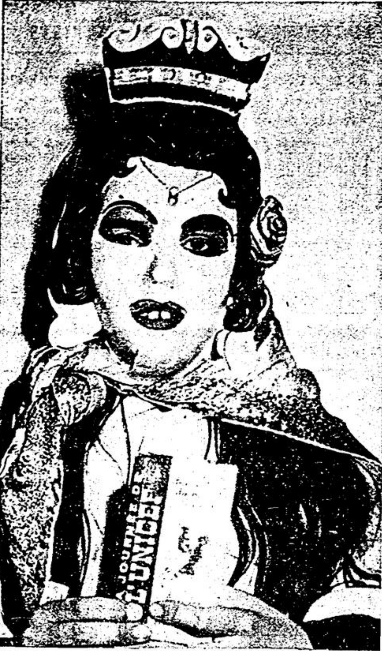
Hundreds of public school children combined business with pleasure on Halloween night in Stouffville and collected over $300 for UNICEF while making their door-to-door rounds.