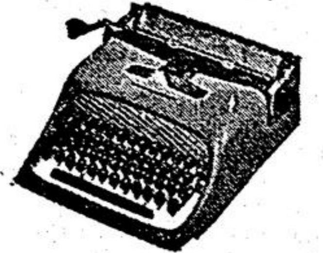
underwood STUDIO 44

High capacity adder with direct subtraction, and other features not usually found on low-priced machines.