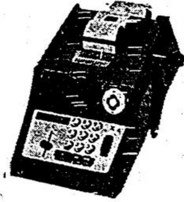
underwood PRIMA 20

get TWO Machines Save nearly $50 Both Underwood-Olivetti