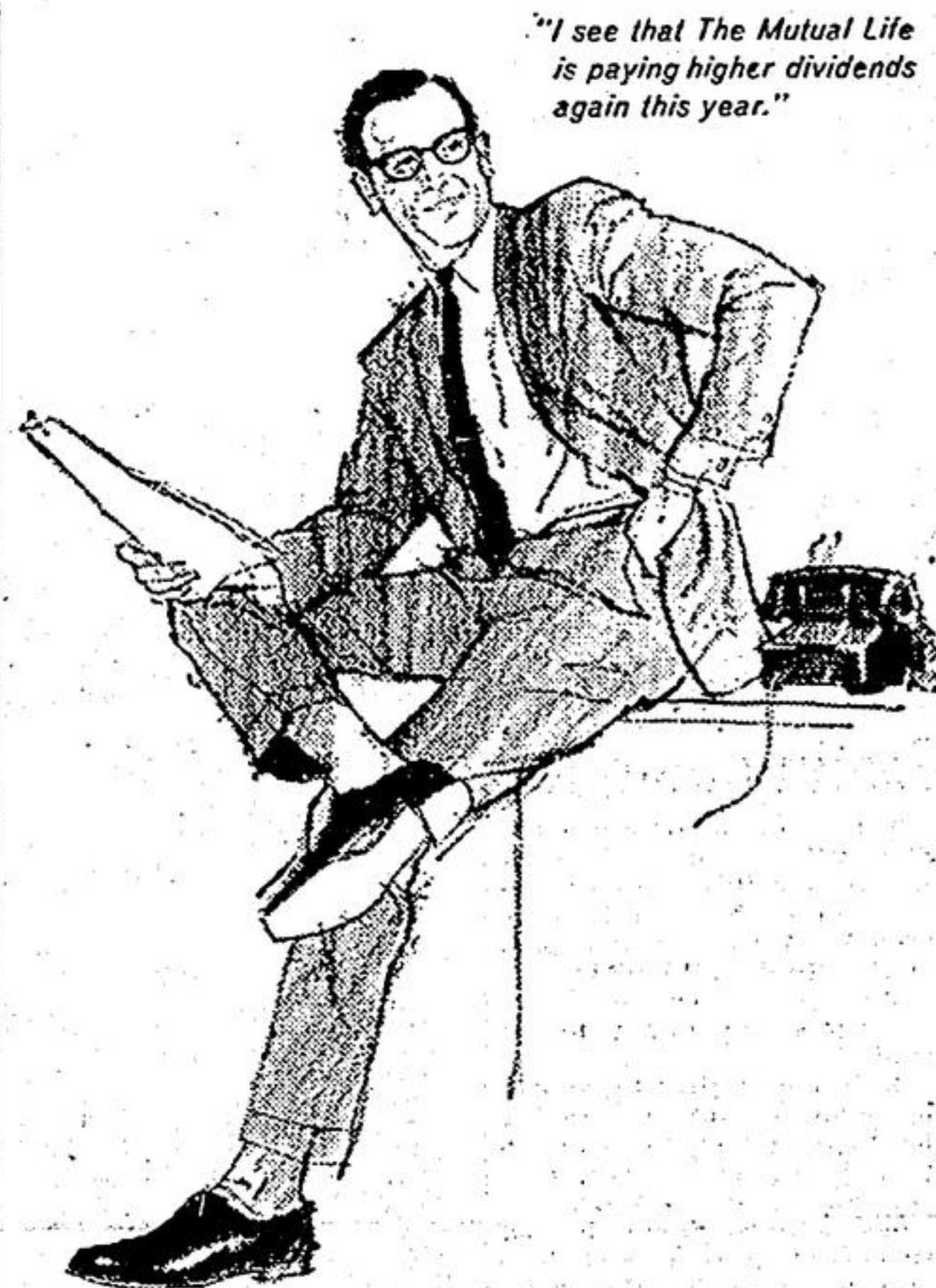
"I see that The Mutual Life is paying higher dividends again this year."