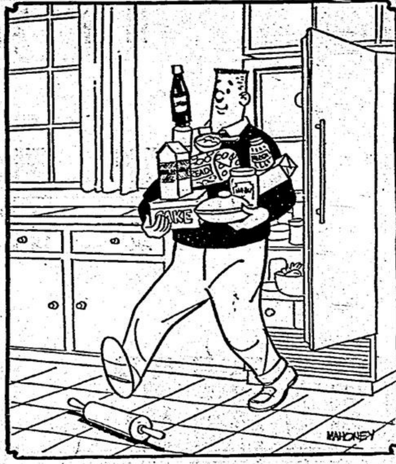
Some fools blow out the gas. A great many more just step on it.