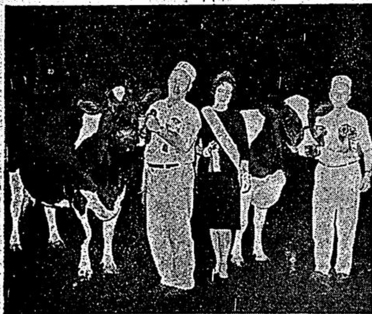
IN THE SHOWRING AND IN HERD PERFORMANCE...

Typewriters to sell or rent THE STOUFFVILLE TRIBUNE